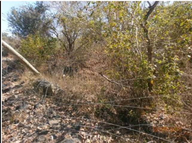
Damaged fenceline at Kibwezi forest.