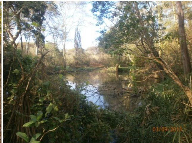
Patrols at Umani area.