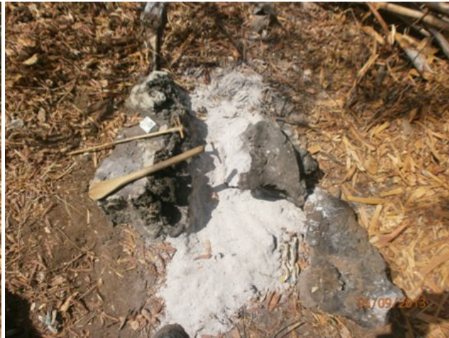
A poacher's camp found at Manyanga area.