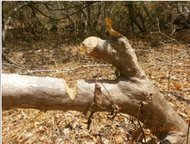
Illegal logging at Kibwezi.