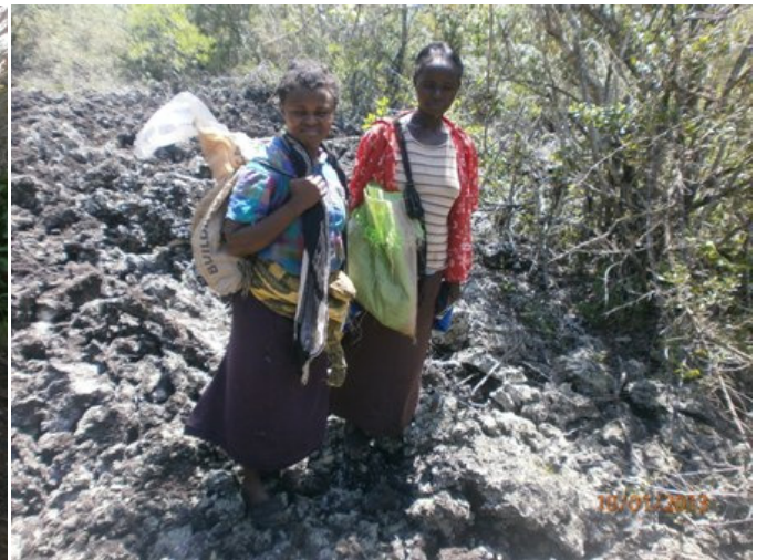
Above: Miraa harvesters arrested.