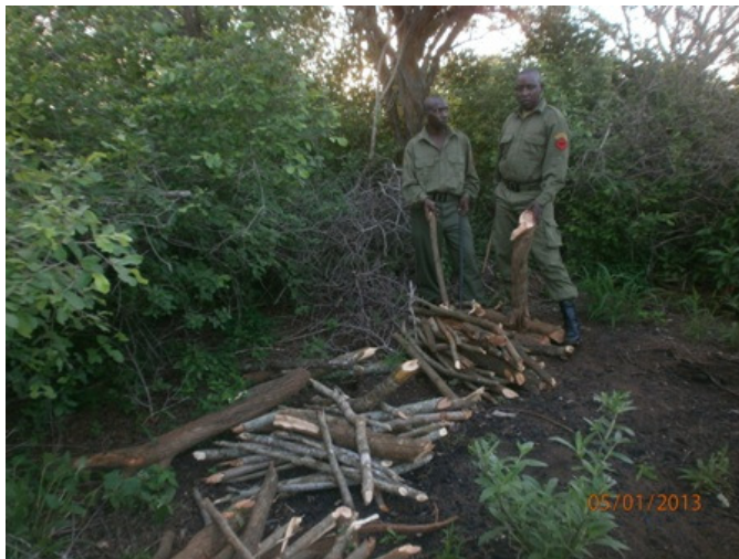
Above: Destroying a pile of wet wood