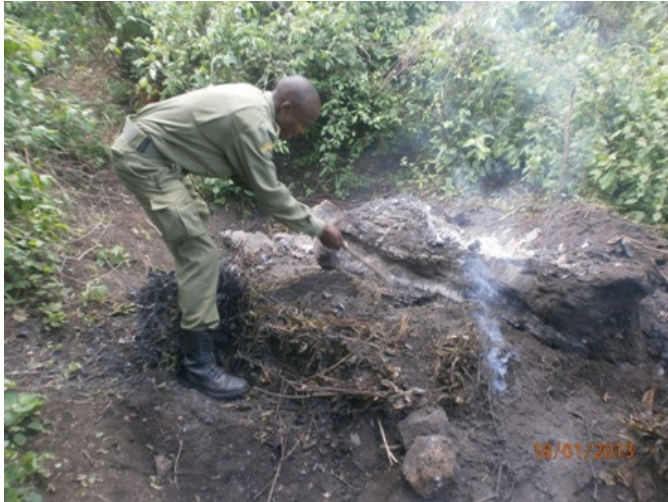
Above: Charcoal kiln being destroyed