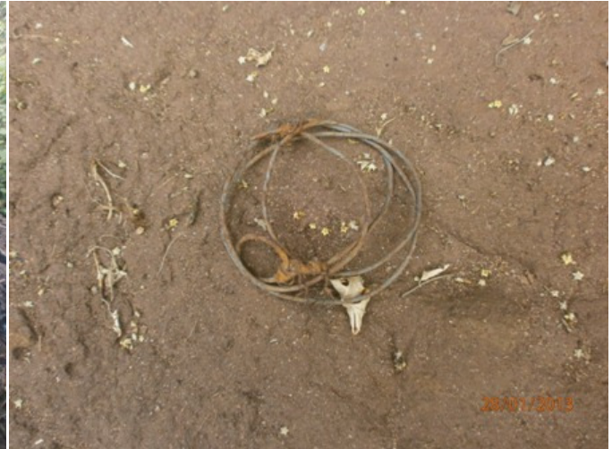
Above: A snare found.