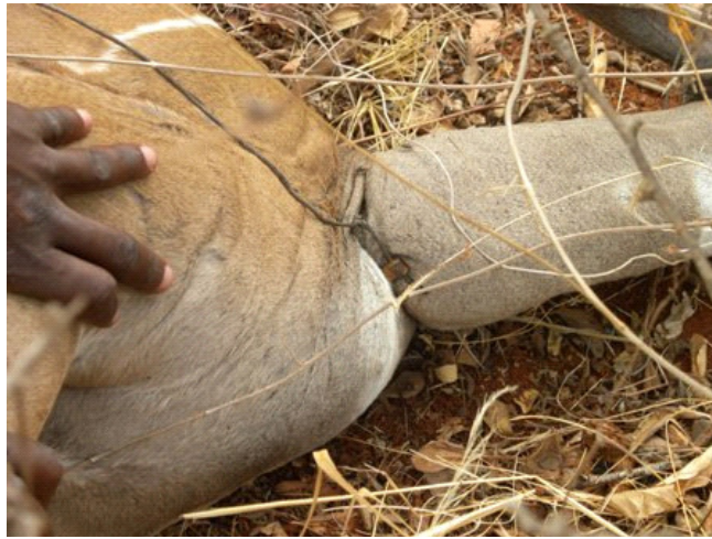
The snare on the Lesser Kudu's neck