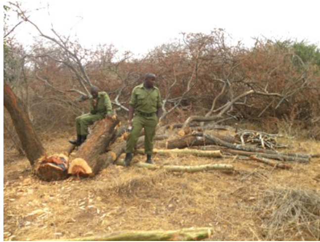
Illegal logging at Gazi area