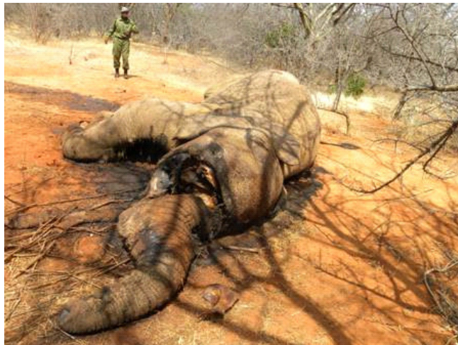
Poached elephant at Misani area