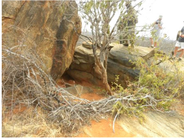
A shooting blind near delta zero in the Triangle