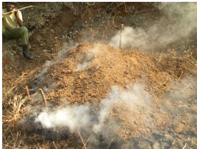
Charcoal kilns in the Triangle