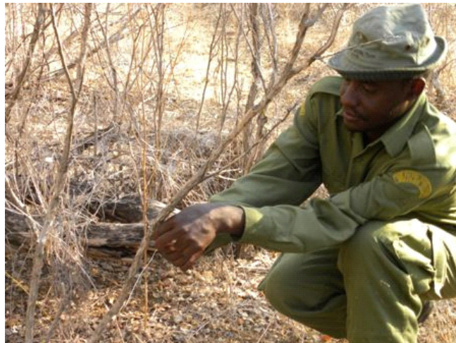
Lifting snares in the Triangle