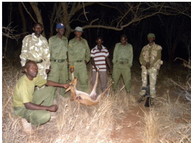
Arrest of a poacher in possession of a snared impala