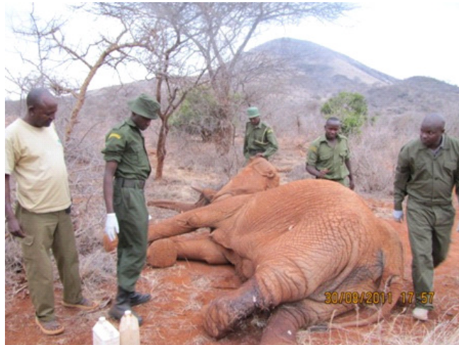
The Team assisted the Vet Unit in treating an injured elephant