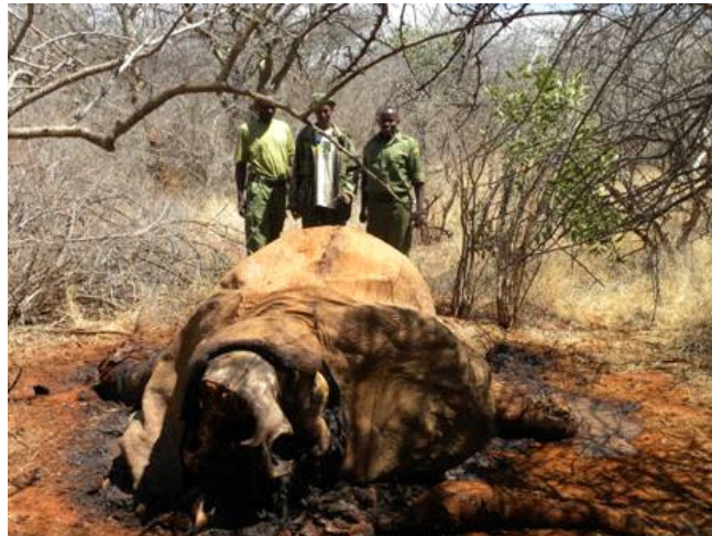
A poached elephant carcass in the Triangle