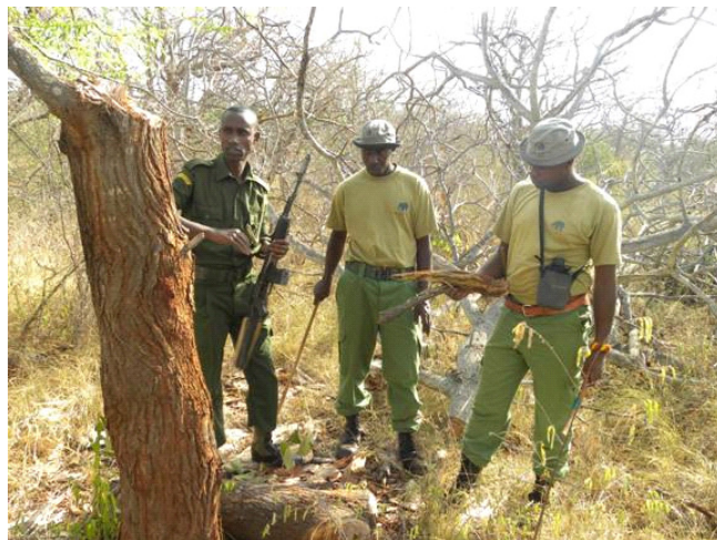
Illegal logging at Kyusiani area along Mito river