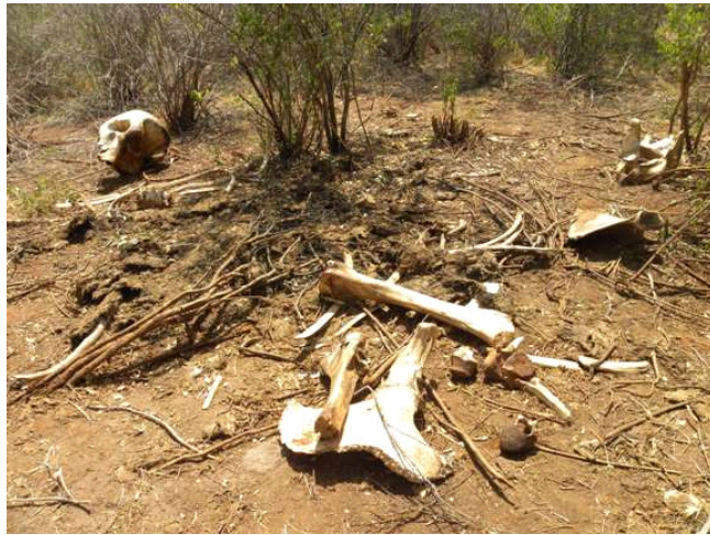
An elephant carcass near Mtito river