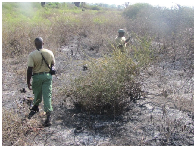
A burnt up area in Kibwezi forest