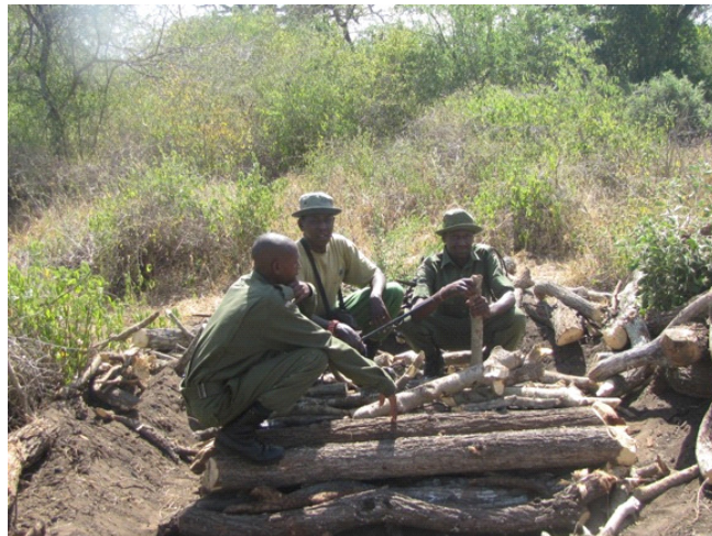
Illegal logging at Kibwezi forest