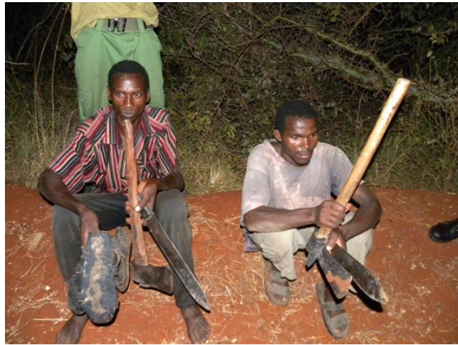
Arrest of illegal loggers in the Triangle