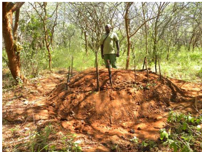
A charcoal kiln in the Triangle