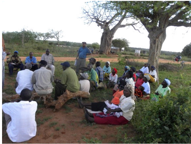
Chief's baraza on the proposed electric fence