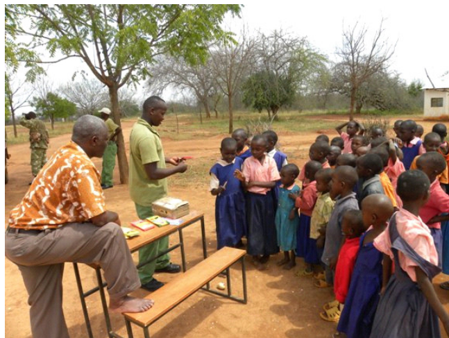
Donation of writing materials at Kamunyu Primary school