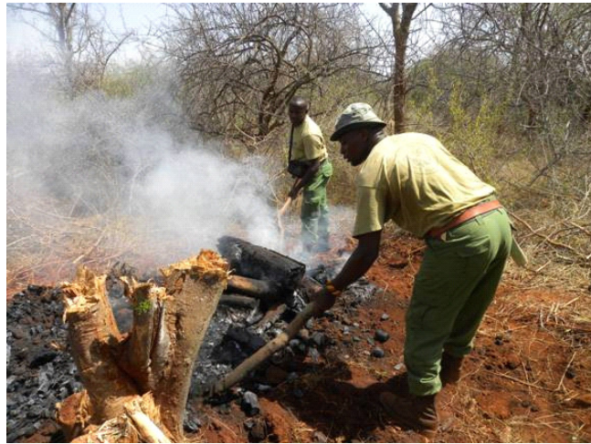
Team destroying illegal charcoal kilns