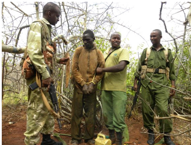
Arrest of an elephant poacher at Mathayoni area in Tsavo West