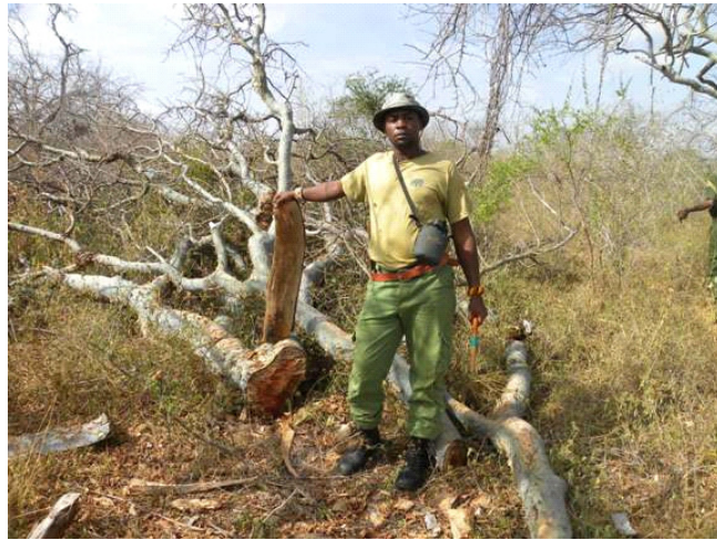
Illegal logging at Kyusiani area along Mito river