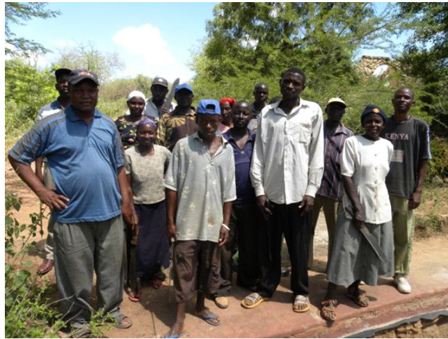
The electric fence committee members at Kyusiani area