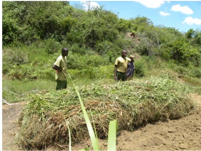
An unlit illegal charcoal kiln