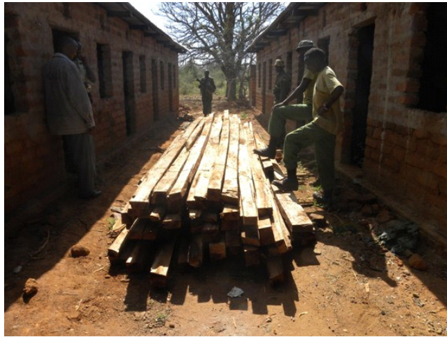
Recovery of illegal timber at Yikitaa