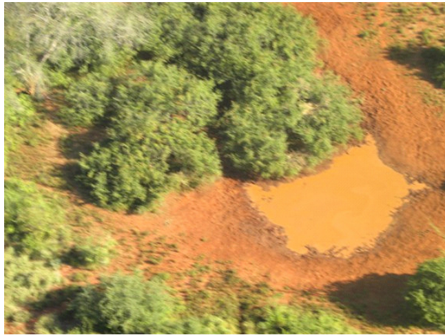
A shooting platform seen during the aerial patrol