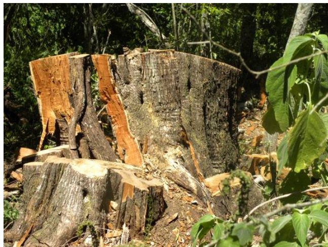
Illegal logging in the Chyulu hills