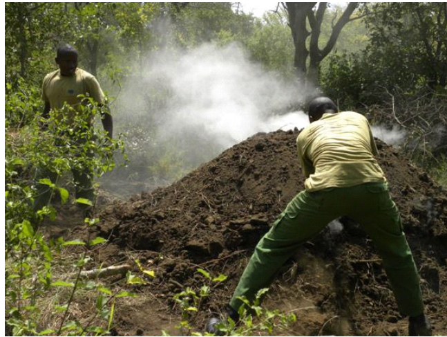
Destroying illegal charcoal kilns in the Mangelete area