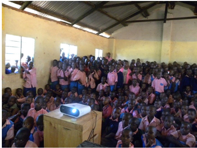
Mtito Andei Primary school video show