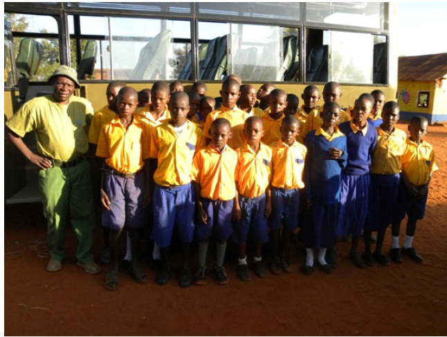
Nzoila pupils getting ready for the trip