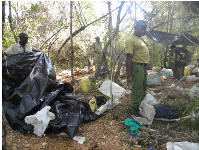
Wood carvers hideouts in the Chyulu hills