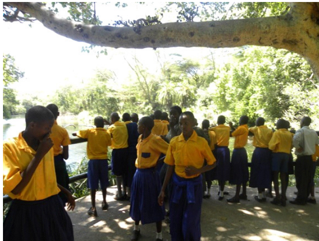
Nzoila pupils at the Mzima springs