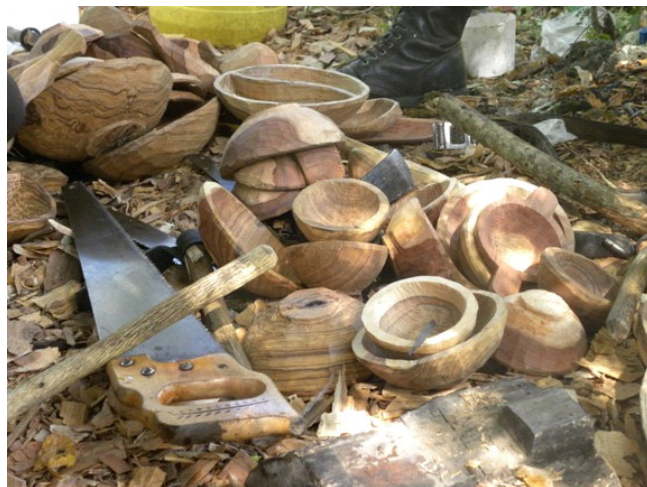
The wood carvings and tools recovered from the arrest of 2 wood carvers