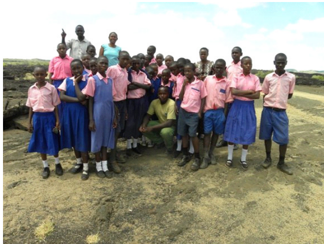
Students on their trip into the Park