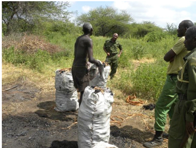
Arrest of Charcoal burner at Iviani