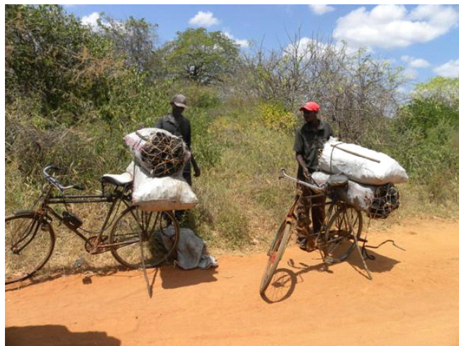
Arrest of Charcoal burners