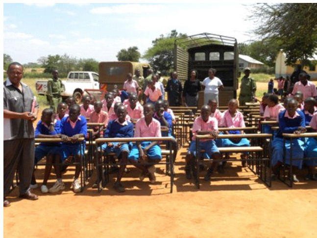
Excited pupils, teachers and parents test the new desks donated by the Trust