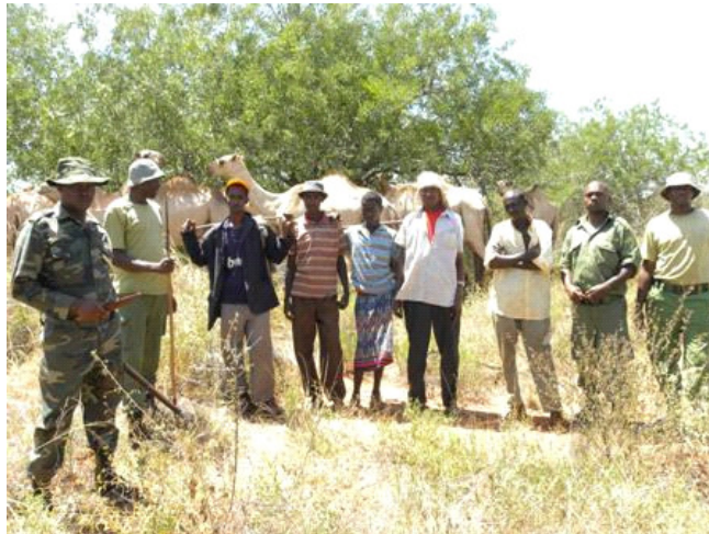
Arrest of livestock herders , grazing their camels in the Park