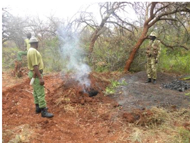
Illegal charcoal kilns in the Park