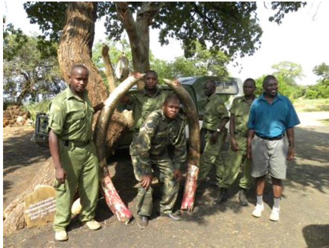
The tusks from the elephant carcass handed to KWS