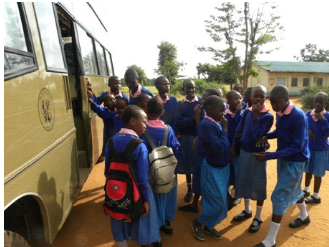
Mtito Primary school pupils boarding the bus for their trip