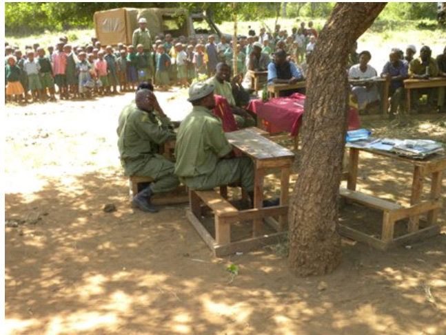
A parents meeting at the Nooka Primary school