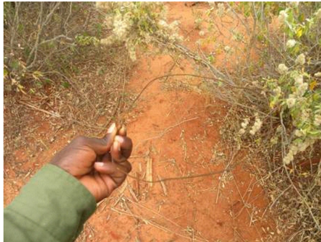
Lifting snares in the Park