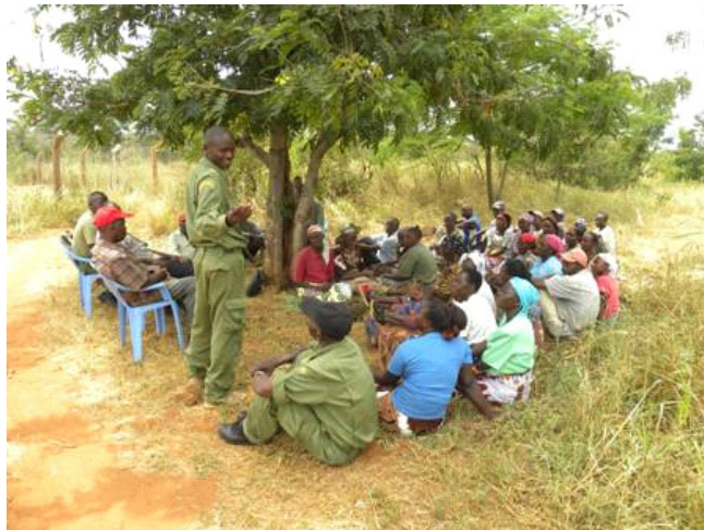
A community meeting with the Team at Iviani