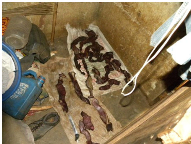
Bush meat found hidden in Mtito Town