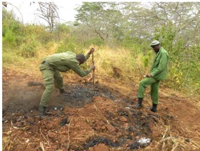
Team destroying illegal charcoal kilns