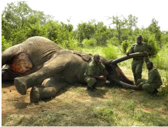
An elephant carcass found at Kamboyo area