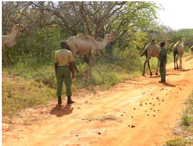
Illegal livestock in the Triangle