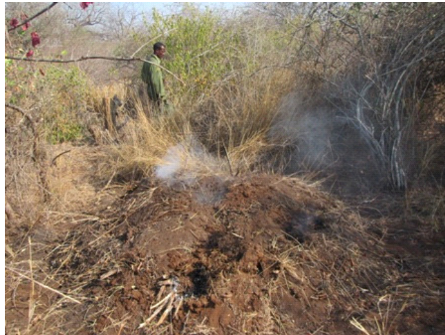
Illegal charcoal kiln