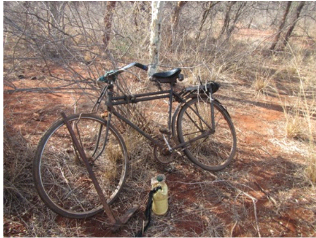
A charcoal burner's bicycle recovered in the triangle