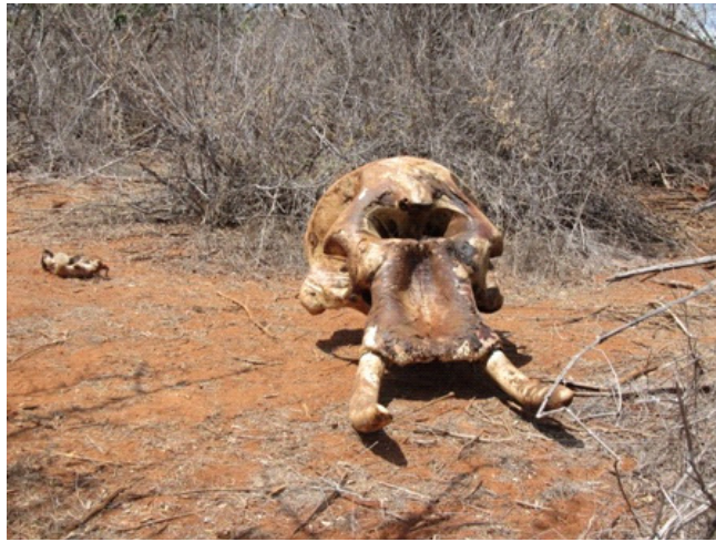
An elephant carcass sighted at Yatta tabakunji area