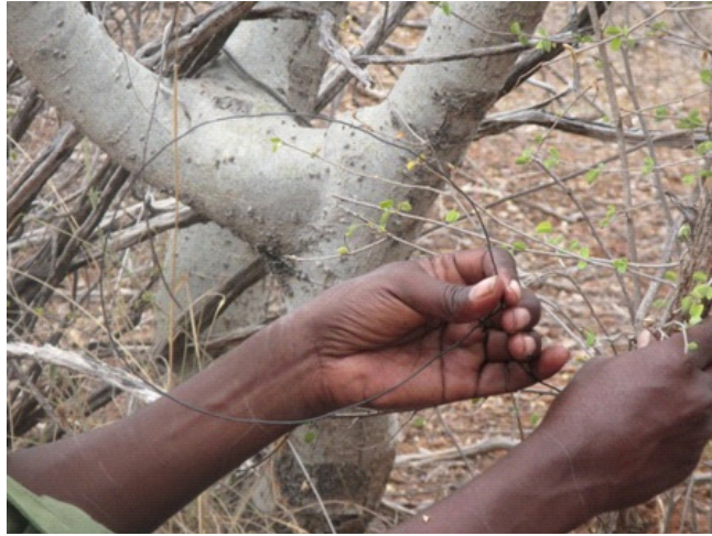
The team removing snares