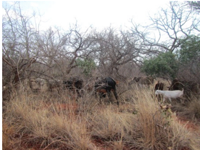
Illegal grazing in the triangle