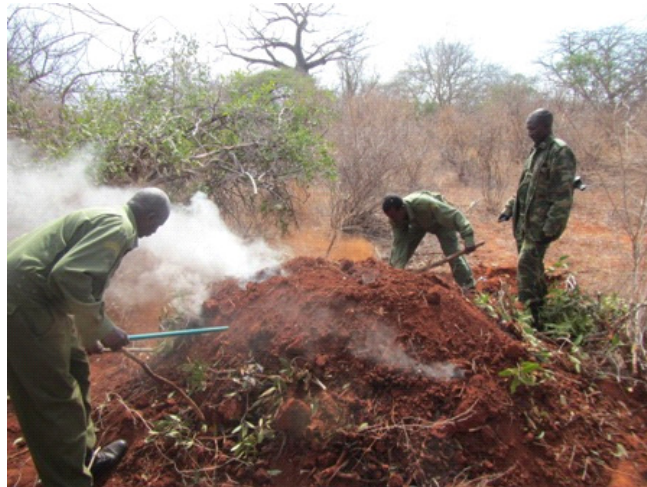
Destroying a charcoal kiln in the triangle