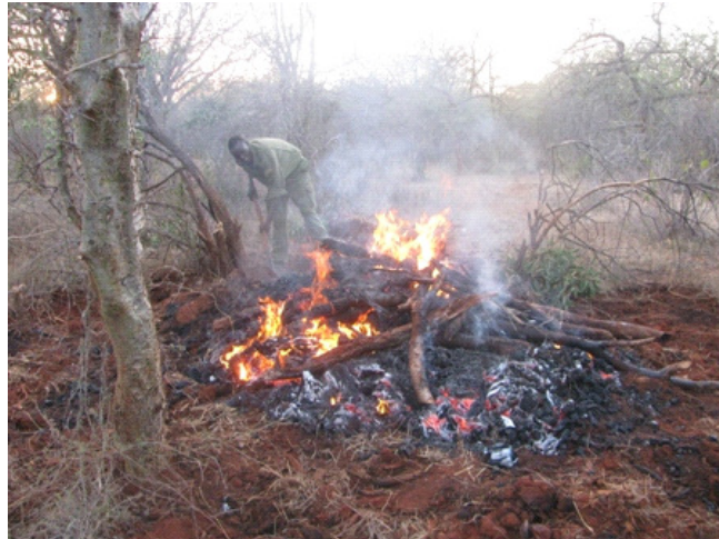
The Team destroying an illegal charcoal kiln