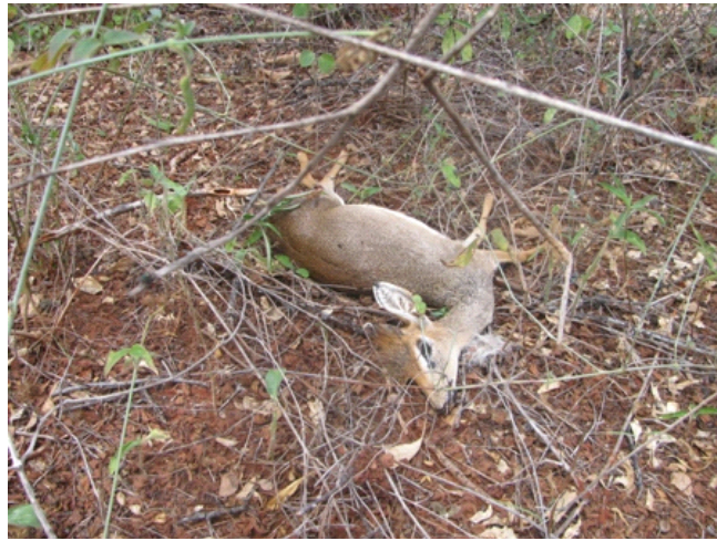
A snared Dikdik