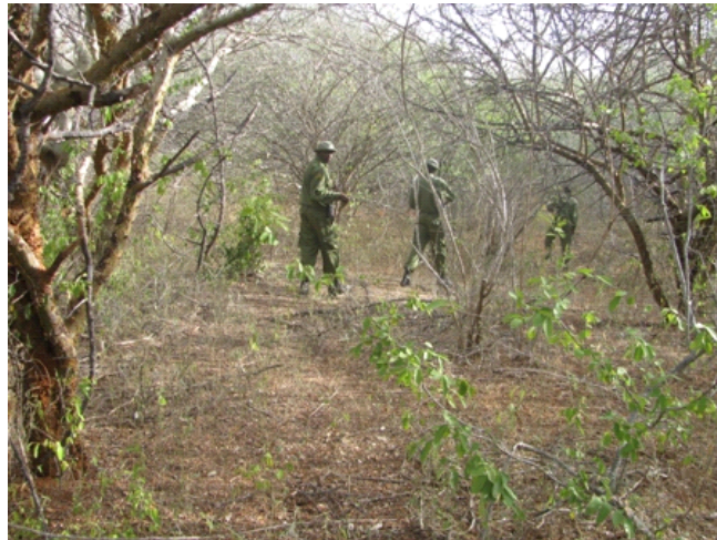
Team patrolling Kalawa