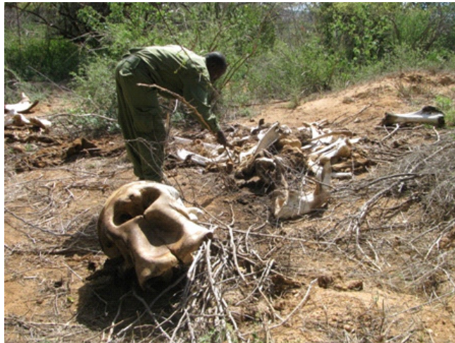
An elephant carcass found outside the Park