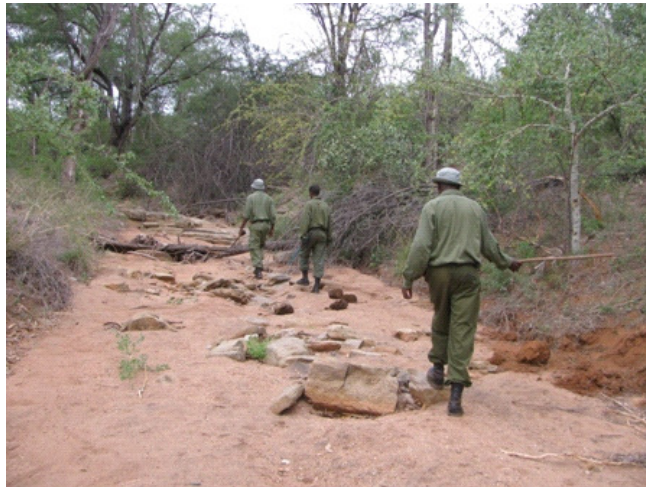
Team members on Patrol