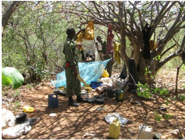
A poachers hide-out sighted at Kalawa area