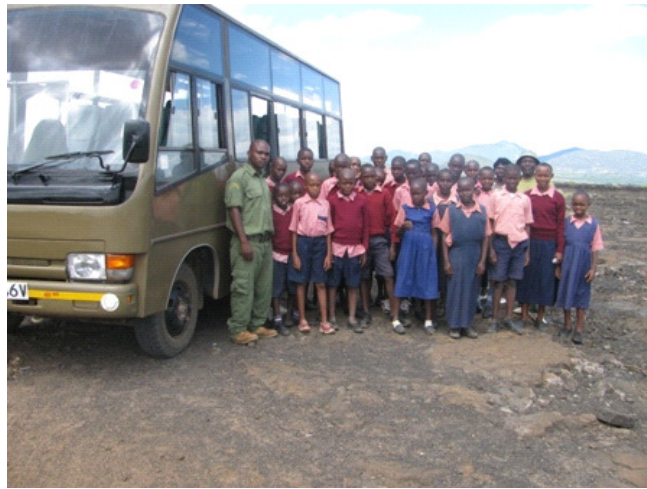
Kiundwani primary pupils at shetani lava