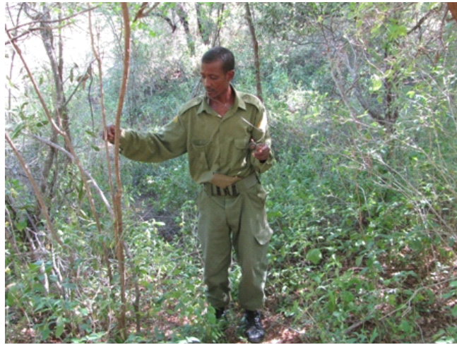
The team removing snares