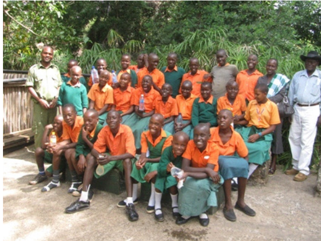
Nthunguni primary school pupils at Mzima Springs