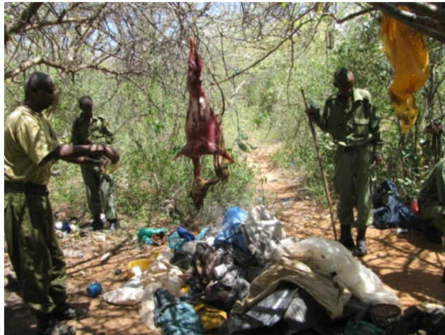
Team members destroying a poachers hideout