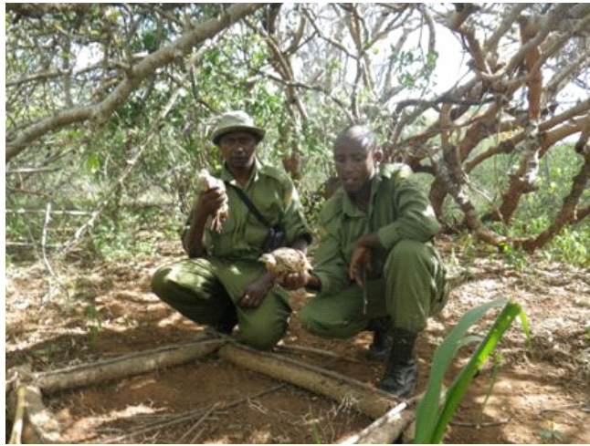
A birds trap found at Kyusiani area