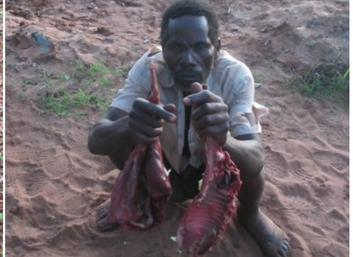
Above: a poacher arrested in possession of game meat