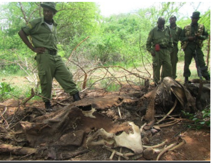
Above: an elephant carcass found on Tsavo Farm (outside the National Park)