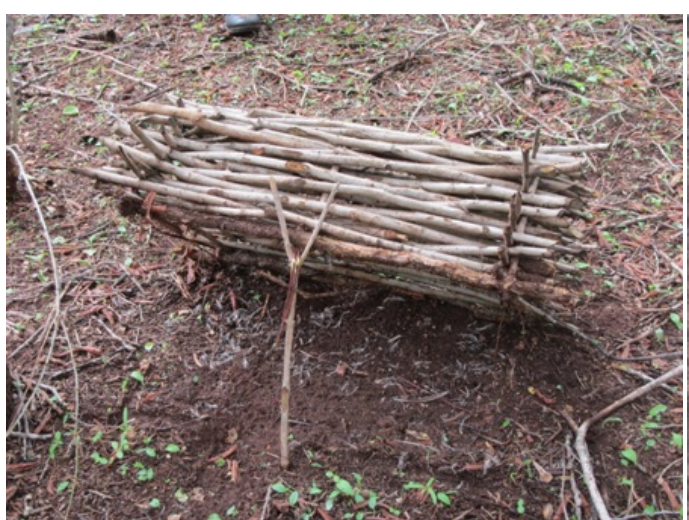
Above: a game bird trap found in the Tsavo West NP triangle