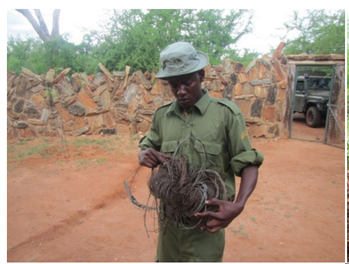
Above: a team member carrying the snares collected during a patrol