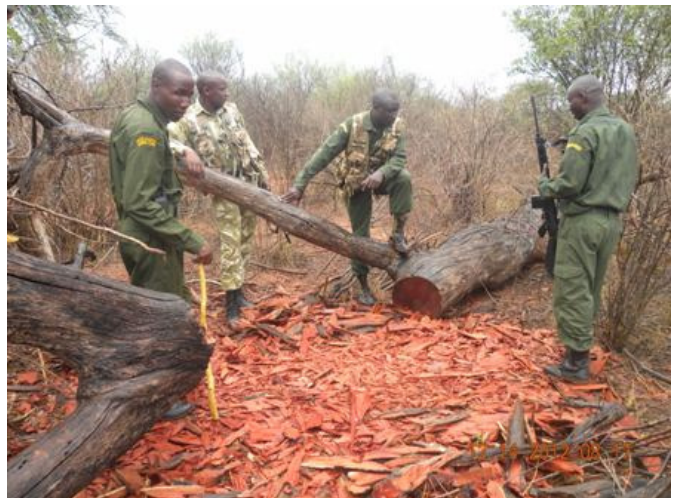
Above: illegal logging at Tundani area inside the Park