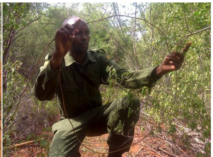
Above: removing medium sized snares which target game such as impala and kudu