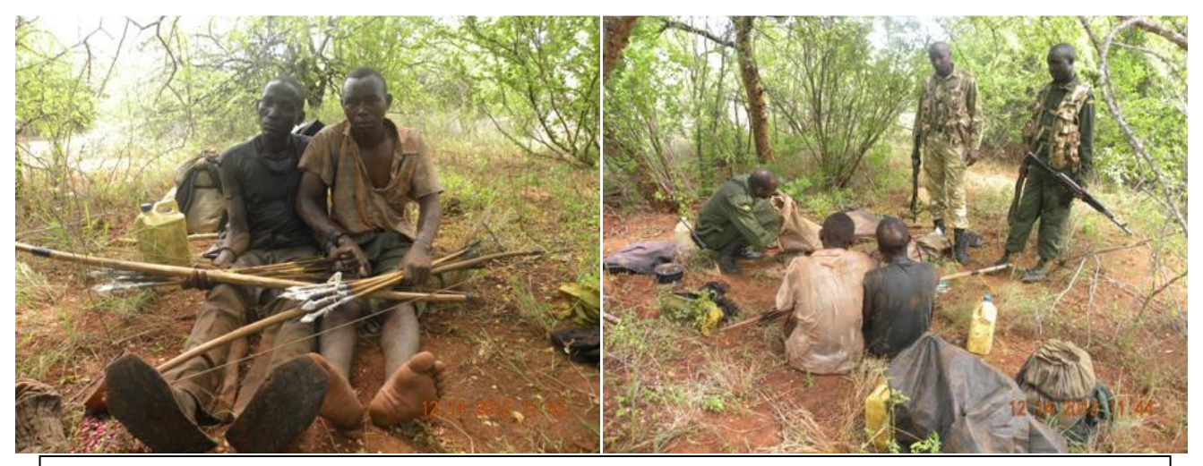
Above: the team arrest 2 poachers in possession of poison arrows. These weapons are most commonly used to kill elephants in the Tsavo Ecosystem