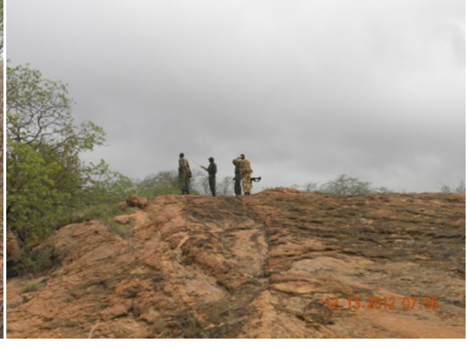
Above: the team on patrol in Kalovoto area