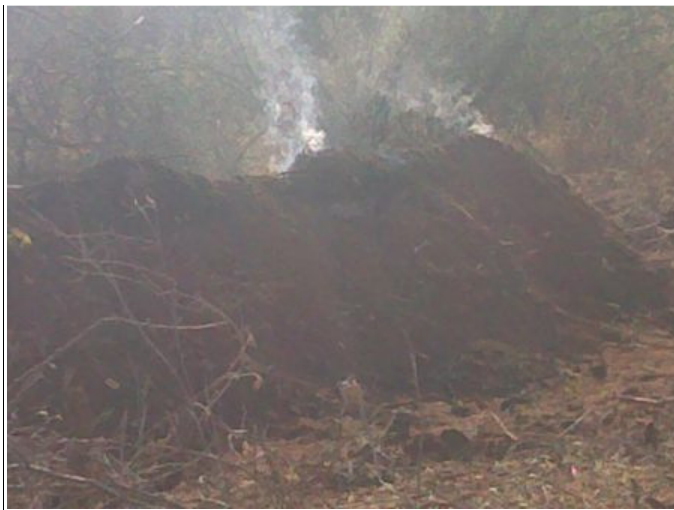
Above: A charcoal kiln in Gazi area..