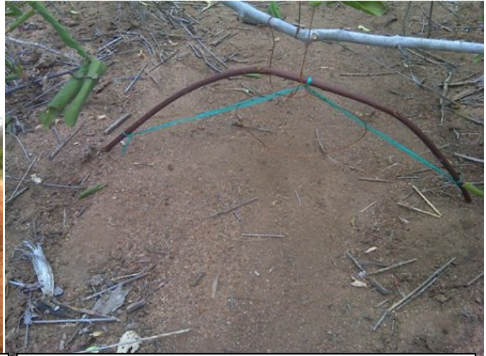
Above: A bird trap in Gazi area.