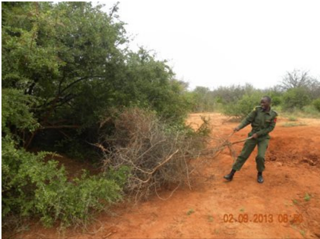
Above: A shooting blind at Tundani area.