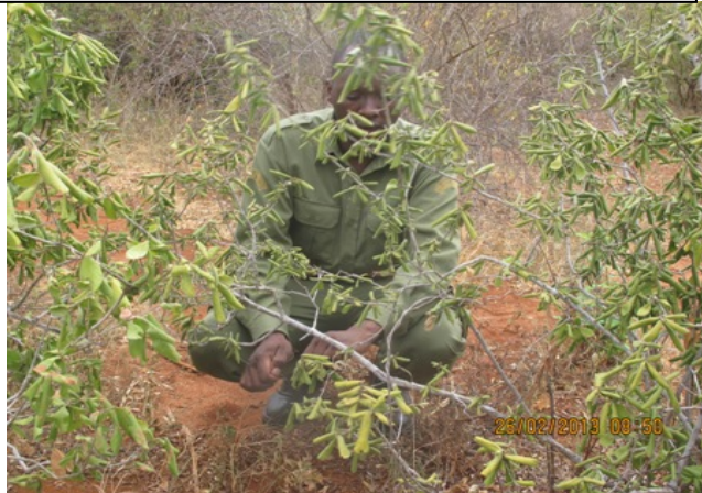
Above: Lifting a small snare at Power Line area.