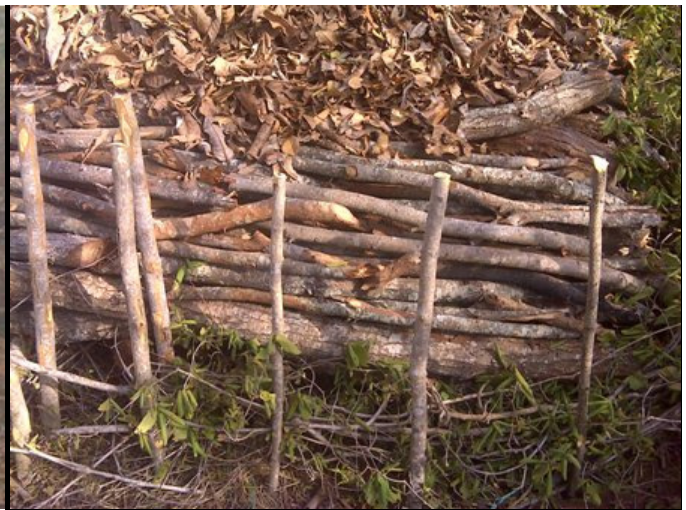
Above: Cut wood in Gazi area.