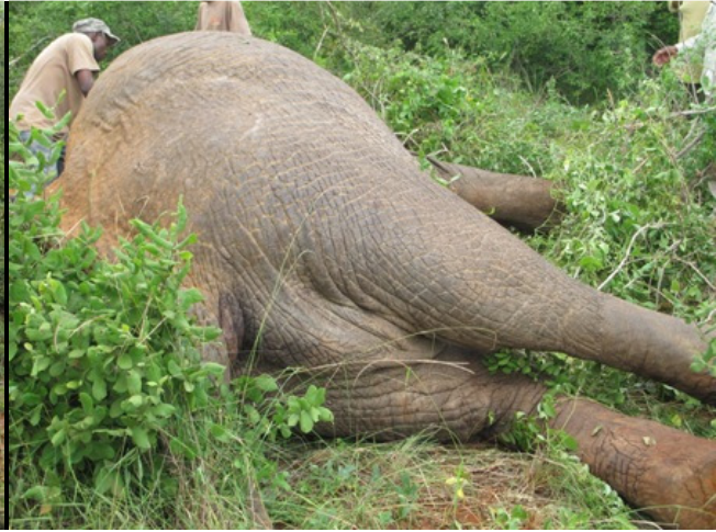
Above right: A killed elephant in Kasala area area.