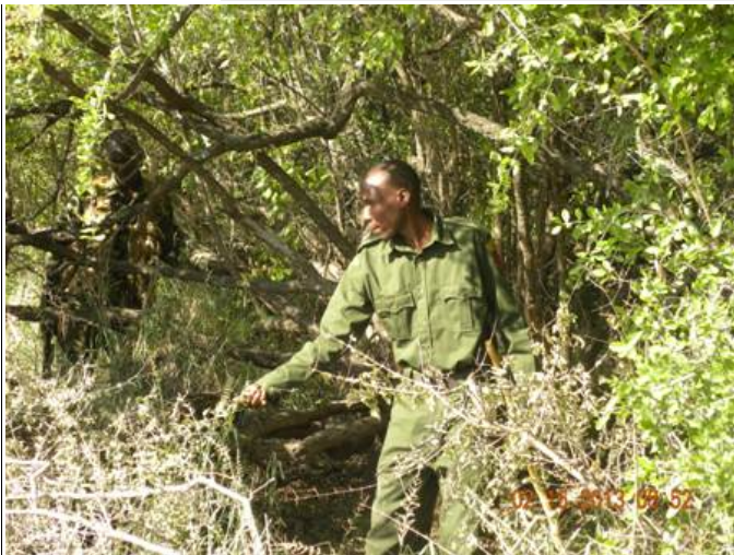
Above: Destroying a shooting blind at Mathea area.