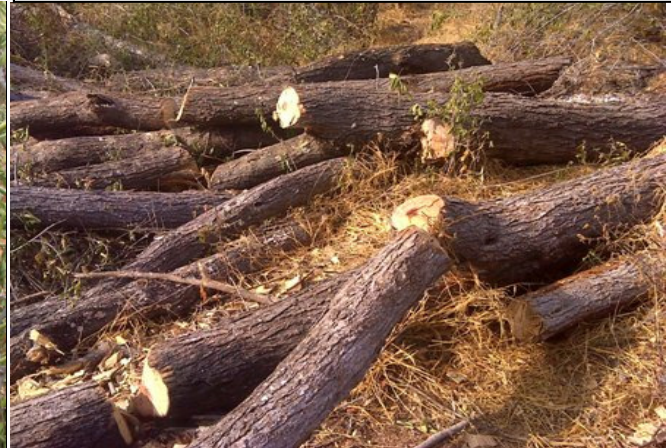
Above: Logs at Gazi.