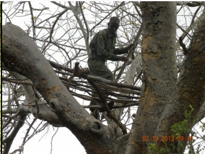
Above: Destroying a shooting platform at Power line area.