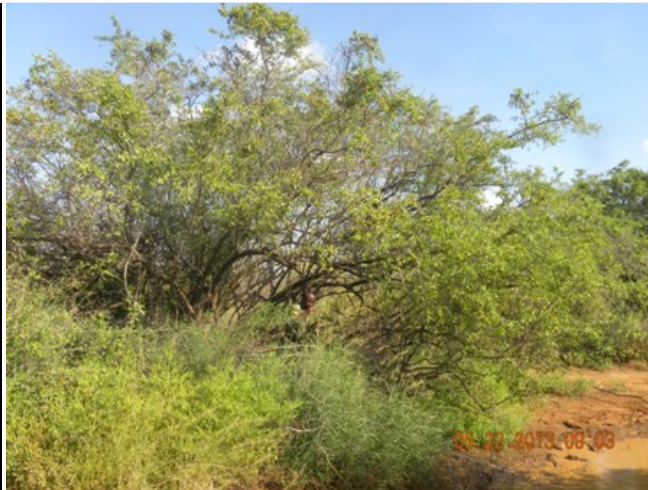
Shooting blind at Umauma area.