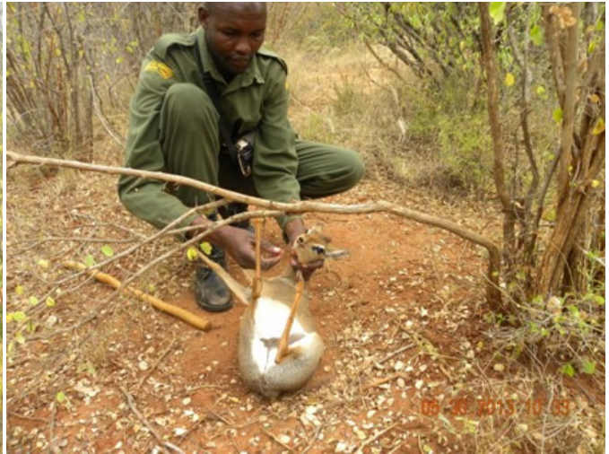
Rescuing a snared pregnant dikdik at Kimweli area.