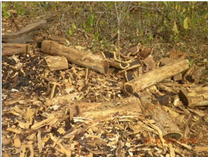
Chips from wood carving at Kimweli area