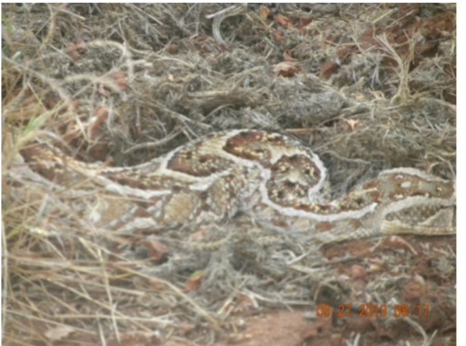
Puff udder seen at Power line.