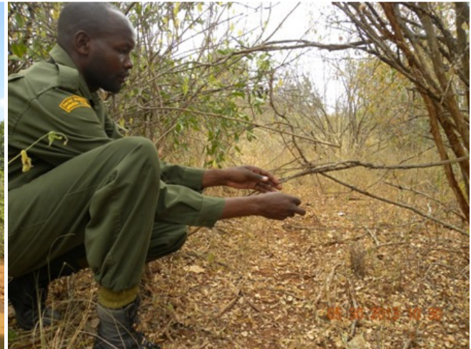
Lifting a small snare at Kimweli.