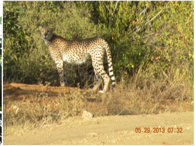
Cheater sighted at Mathae area.