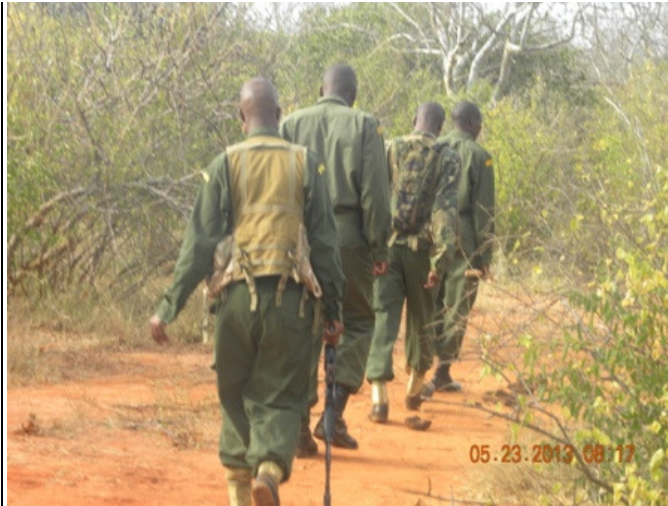
Team patrolling at Leslau dam.