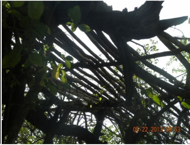
Shooting platform at Umauma area.