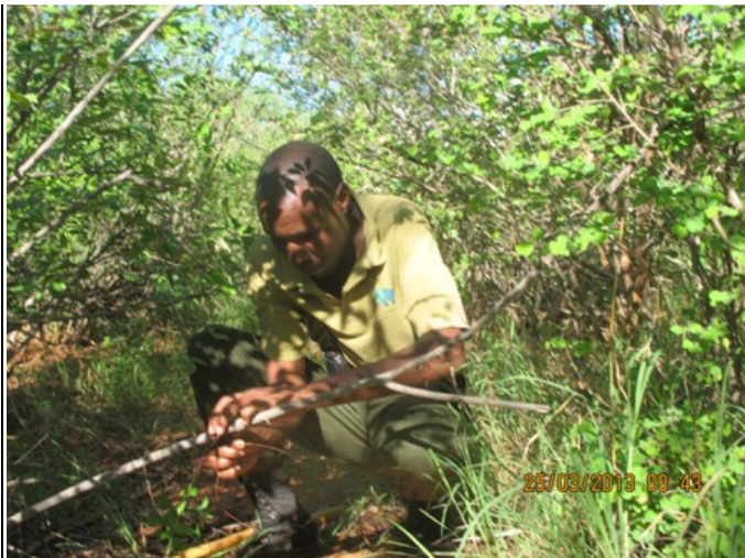
Above: Lifting a medium snare at Power line.