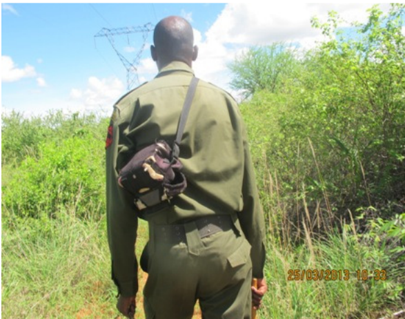
Above: team patrolling at Power line