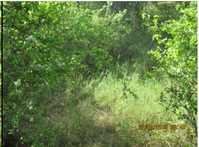
Above: A medium snare at Kalovoto.