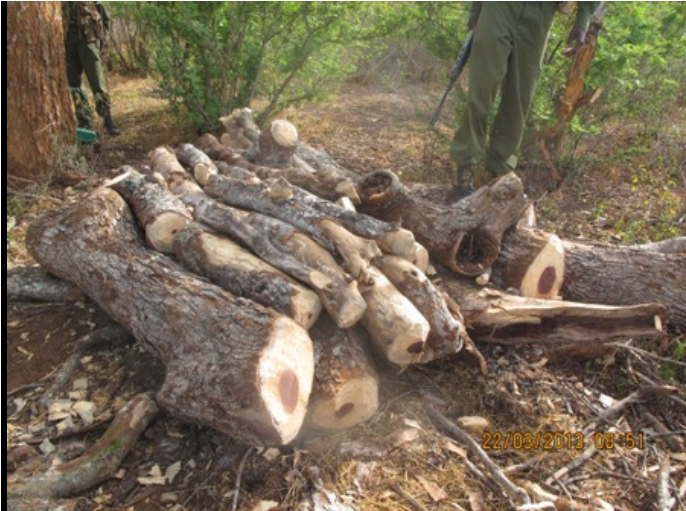
Above: Logging in Gazi.