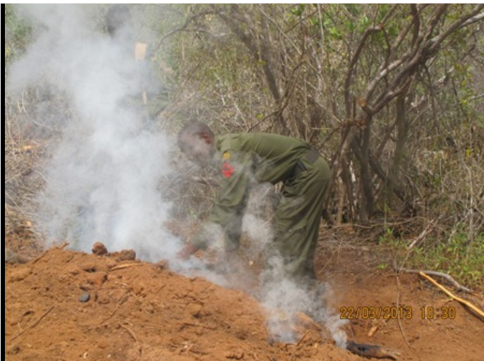
Above: Destroying a charcoal kiln in Gazi.