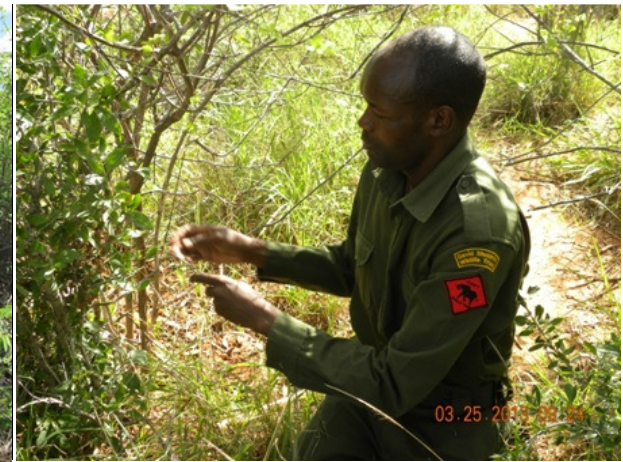
Above: Lifting a medium snare at Power line