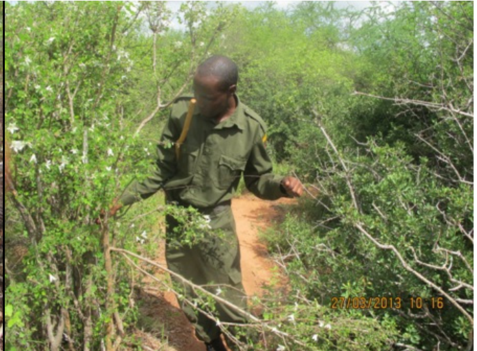
Above: Lifting a medium snare at Kalovoto.