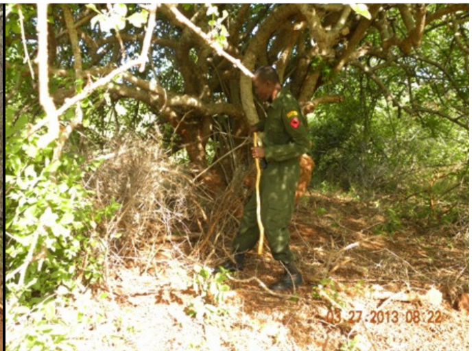
Above: Destroying a shooting blind Kalovoto.