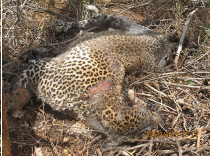
Above right: A snared leopard found in Gazi area.