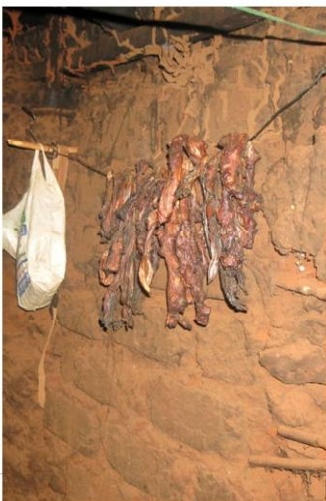
Changaa brewer arrested with elephant and buffalo bushmeat at her den