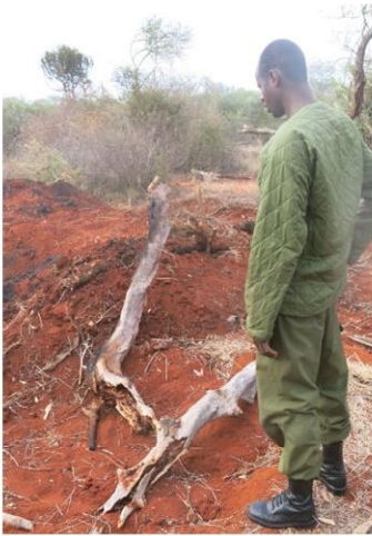
Sighting and destroying an active charcoal kiln at Oza ranch area