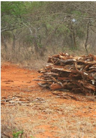
Illegal logging taking place inside the ranch