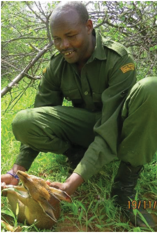
The team rescued a snared dikdik just in time