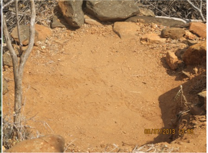
Poacher's hideout near Sheldrick's blind.