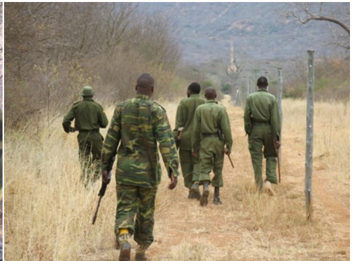
Patrol at Kasaala fenceline.