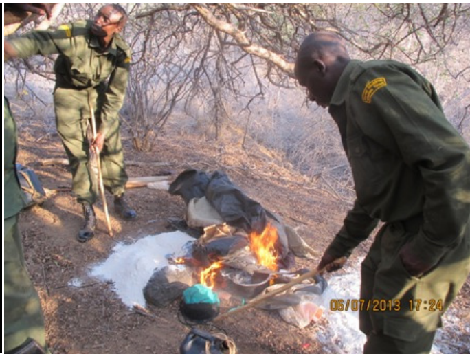
Team destroying poacher's camp at Kitanda mboo.