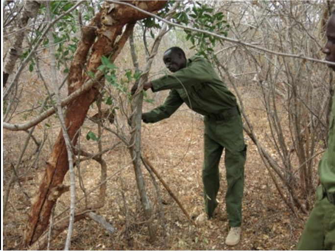
Lifting of snares at Kanziku area.