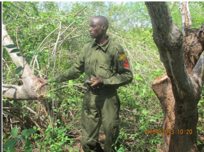
Above: Logging at Kasala fence line.