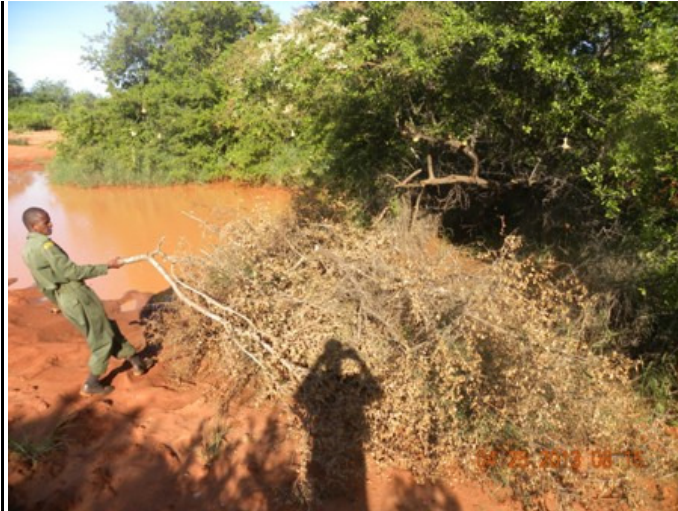
Above: Destroying a shooting blind at Leslau area.