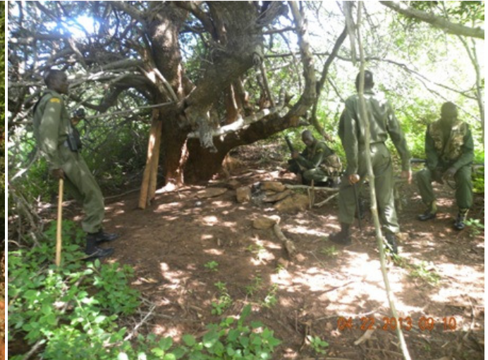
Above: Poacher's hideout at Tundani.