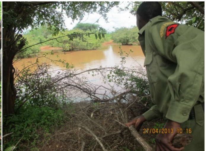
Above: Destroying a shooting blind at Kasala powerline.