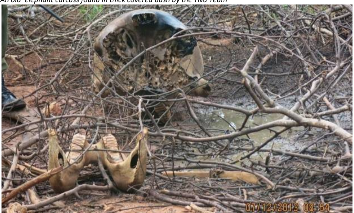
A Tiva team member discovers and removes a snare; 103 removed by the Tiva Team this month

An old elephant carcass found in thick covered bush by the Tiva Team