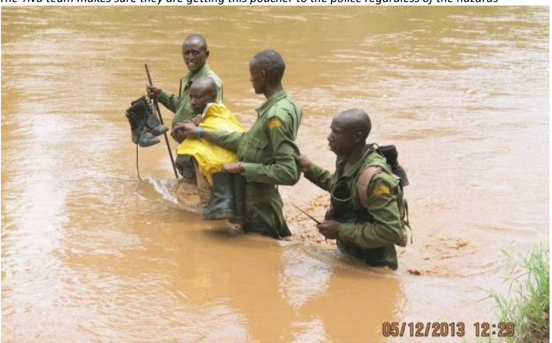
The Tiva Team walks two captured poachers and their evidence to be booked

The Tiva team makes sure they are getting this poacher to the police regardless of the hazards