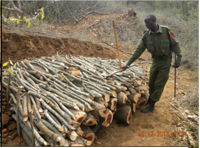
Above: Wood ready for charcoal burning.