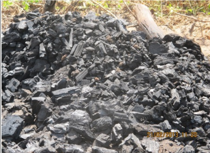
Above: Burnt charcoal at Gazi area.