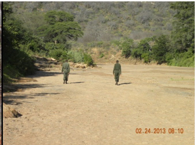
Above: Team patrolling at Tiva area.