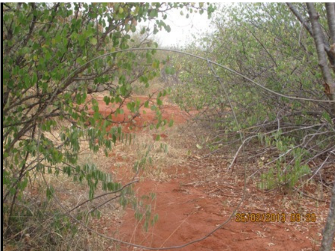
Above: Medium snare at Power line area..