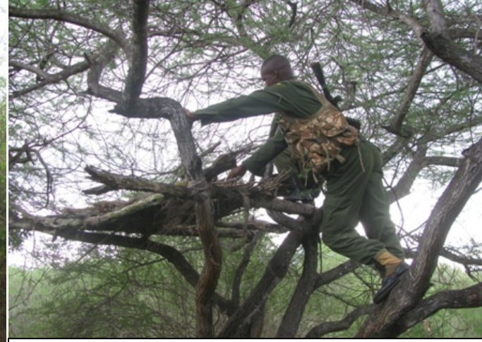
Above: KWS rangers help destroy a shooting platform .