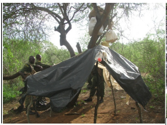
Above: Destroying a shooting blind at Leslau area.