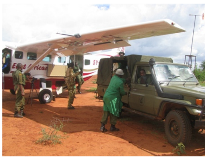
Above: the rescue of an orphaned elephant in the Maktau area, the orphan was loaded in the rescue plane and sent to DSWT Nairobi