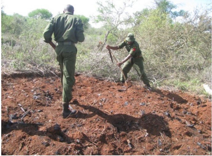
Above: the team destroying an illegal charcoal kiln