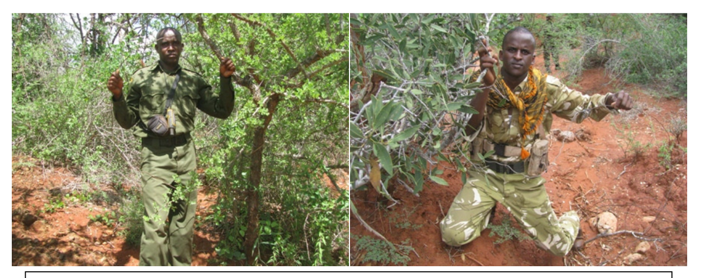
Above: The team removed many snares from the Kenya-Tanzania border near Lake Jipe.