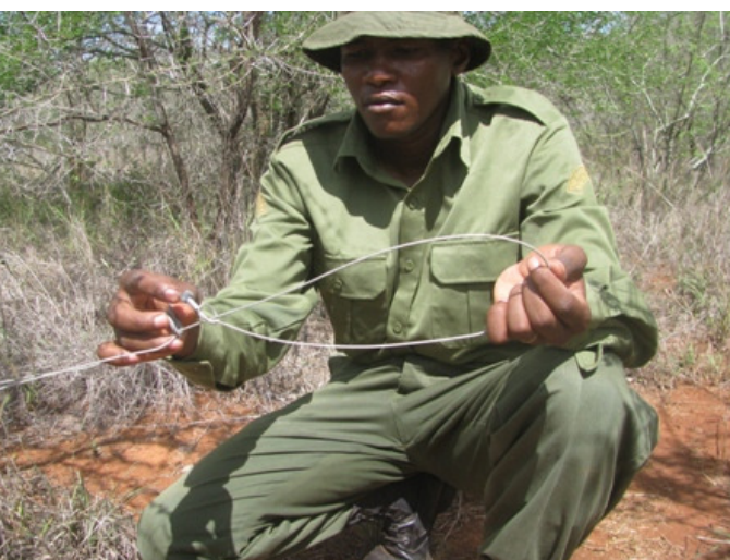
Above: the team removing snares on Salt Lick Ranch