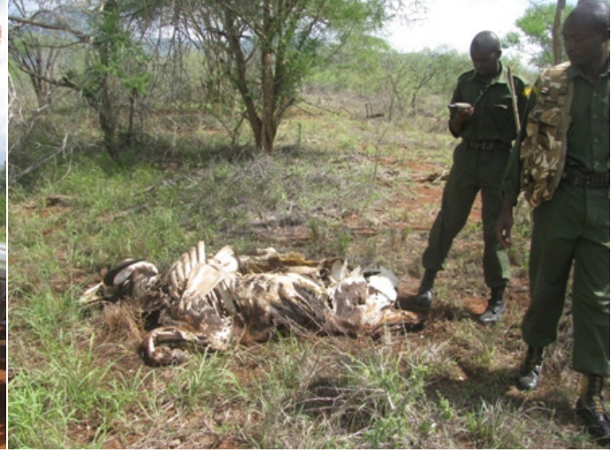
Above: a buffalo carcass found at Salk Lick