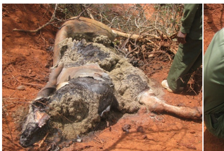
Above: the carcass of a snared Eland found near the Kenya-Tanzania border