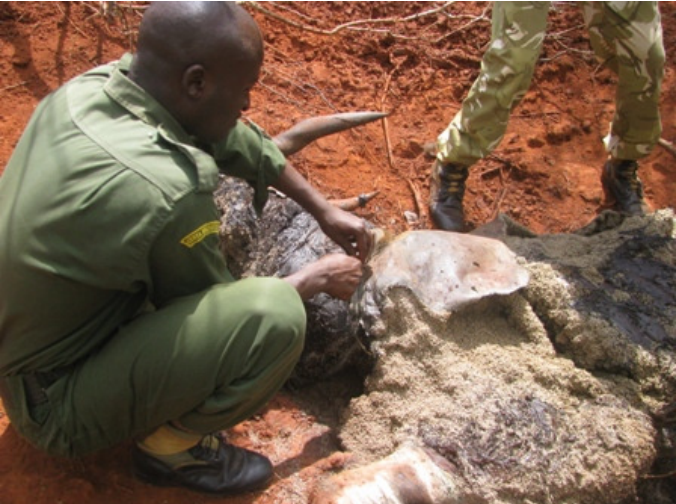
Above: a team member removes the snares from the carcass