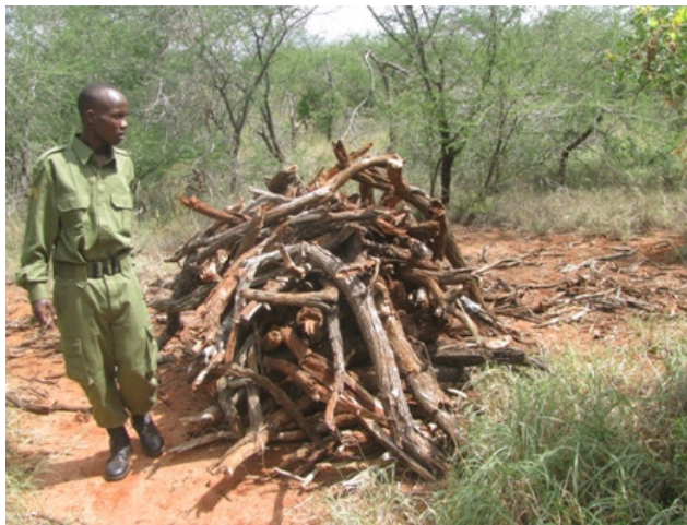
Above: Illegal firewood collection at the saltlick ranch