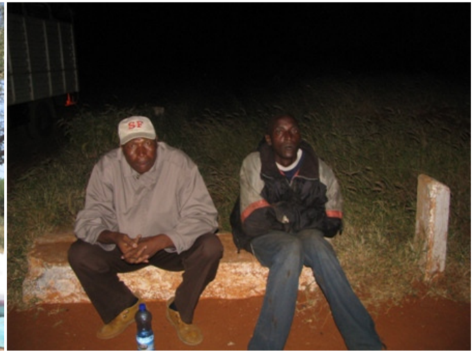
Above: Two suspects found in the lorry.