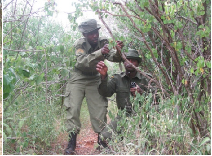
Above: Desnaring exercise at Mbulia ranch