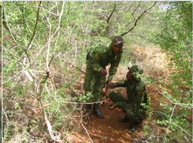
Above: Underground traps found