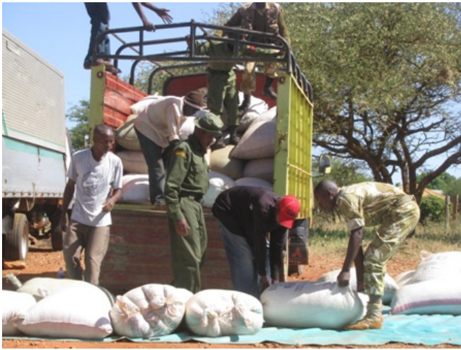
Above: The team conducting a thorough search in a lorry believed to be ferrying poachers