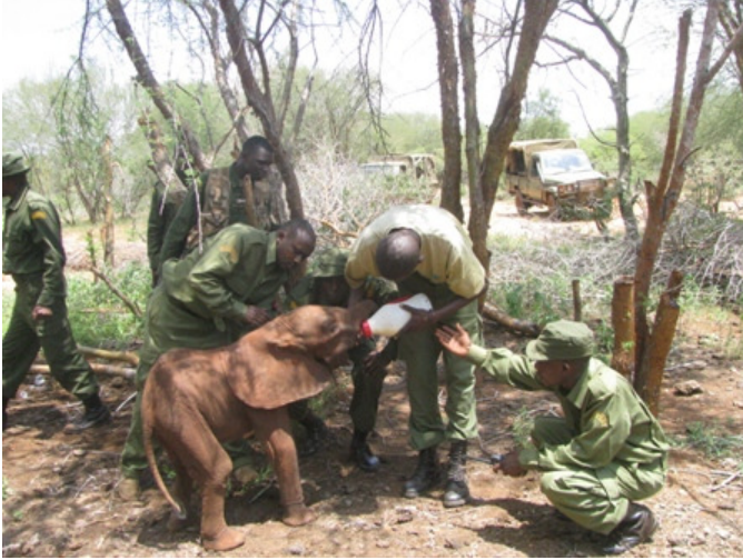
Above: Voi keepers and Simba team rescuing an orphaned male elephant in Mwananchi ranch