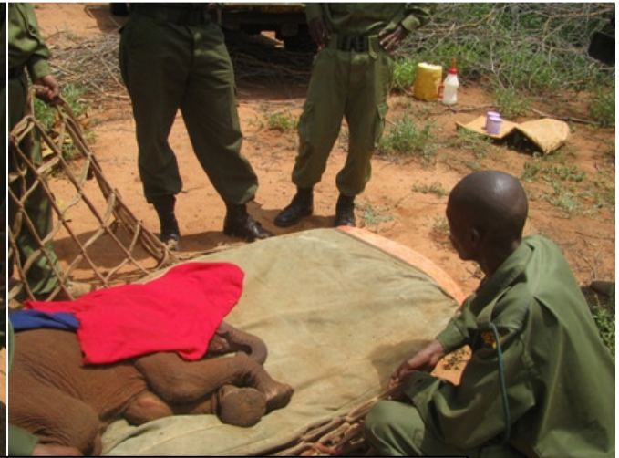
Above right: The rescued elephant calf.