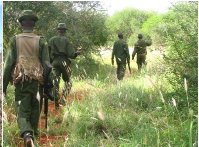
Above: Simba team patrolling