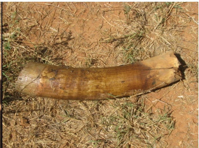
Above: Tusks from the elephant.