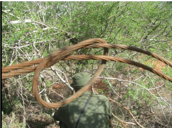
Above: A heavy buffalo snare found at Salt link ranch.