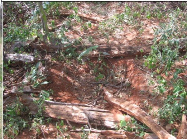
Above: An elephant snare destroyed at Mbulia ranch.