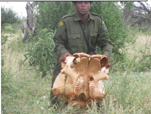
Above: An old elephant skull found at Ngutuini area.