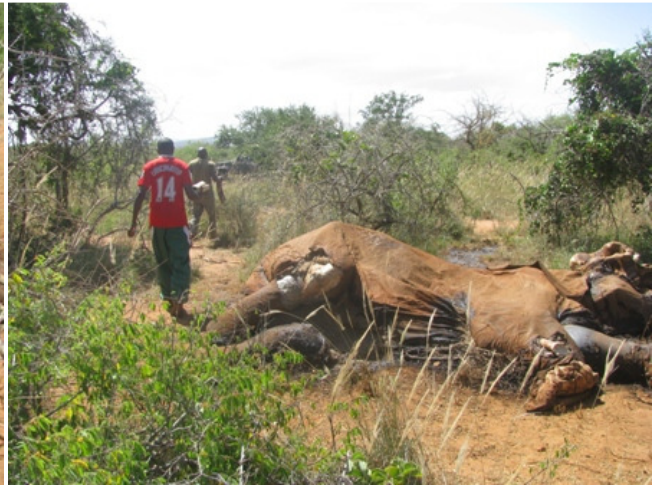
Above right: A two week old elephant found near Maktau park entry.