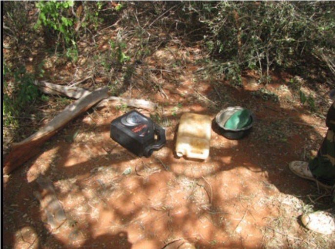
Above: Fresh poachers' camp found at Mbulia