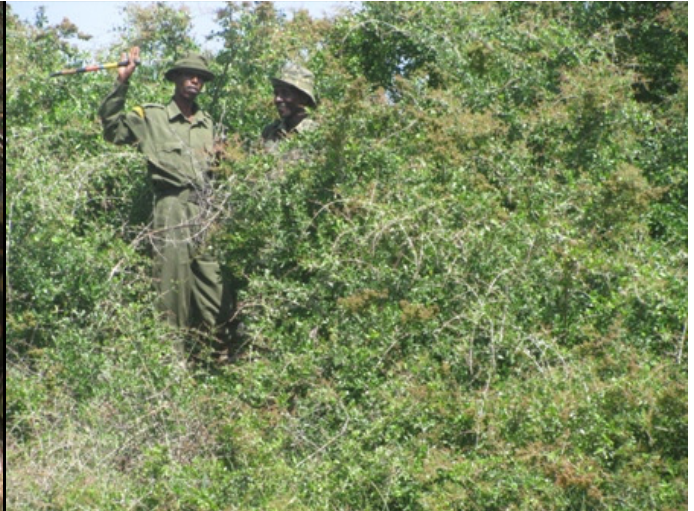
Above: A shooting hide found at Mbulia.