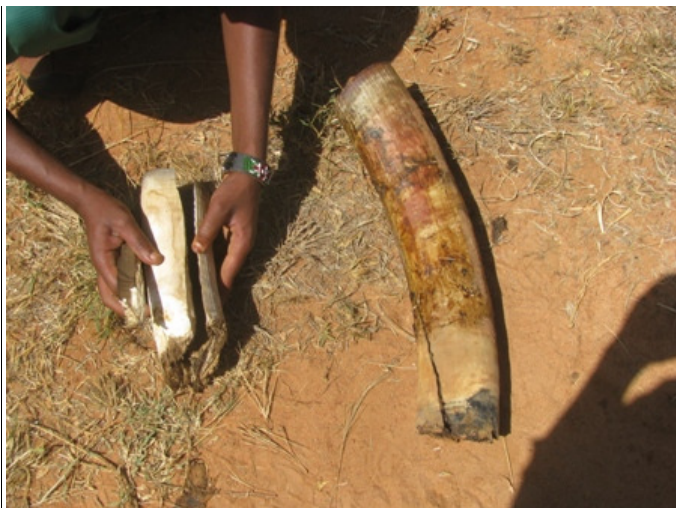
Above: Tusks from the elephant.