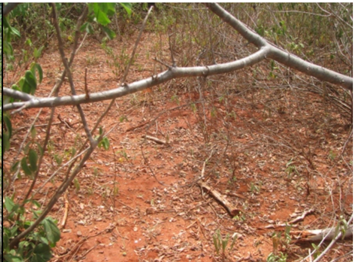
Above: A small snare found at Mbulia ranch.