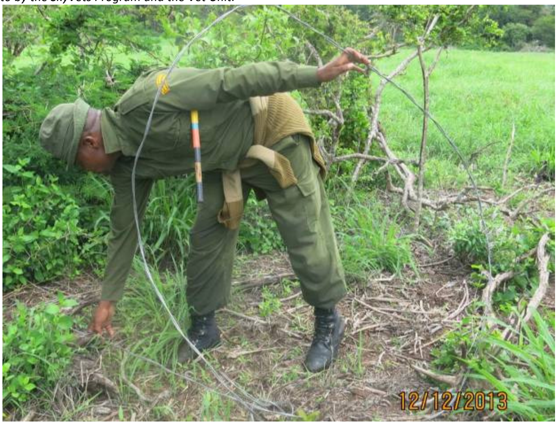
A poachers hideout discovered by the Ziwani Team

Ziwani team member discovers a large snare intended for buffalo, kudu and other large animals. It is this kind of snare that often tightens around an elephants leg or trunk, inflicting immensely painful wounds that are attended to by the SkyVets Program and the Vet Unit.