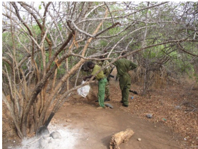
A poacher's hideout in Macho kombo area