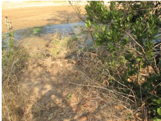
A shooting platform at Tundani area