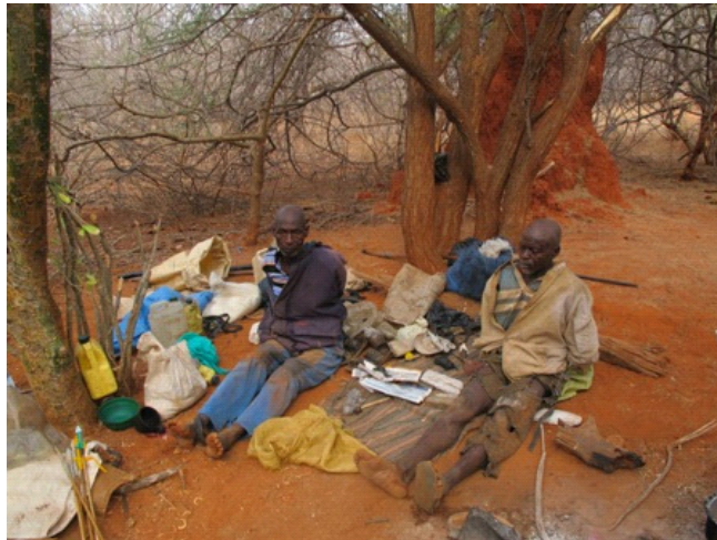
Poachers arrested at Wamata area