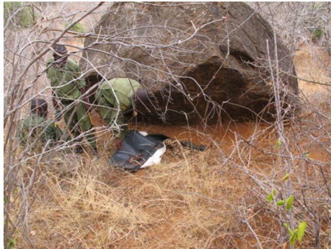
A poacher's hideout