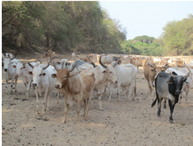
Illegal cattle grazing in the Park