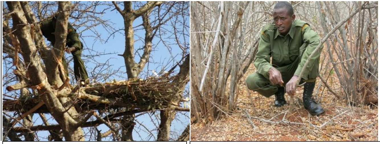
Destroying a shooting platform at Tiva area.