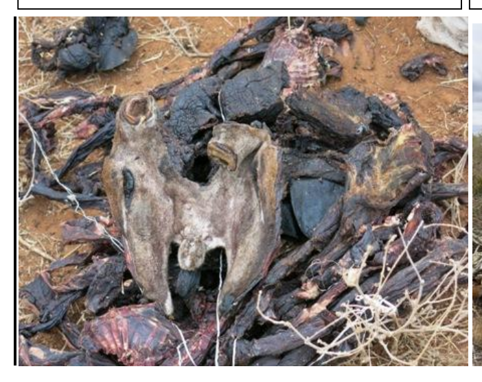
Desnaring at Gazi area.