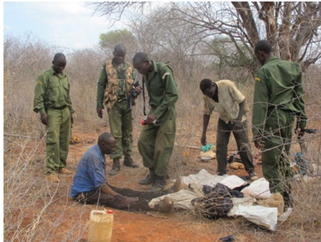
Two notorious poachers arrested in Gazi area