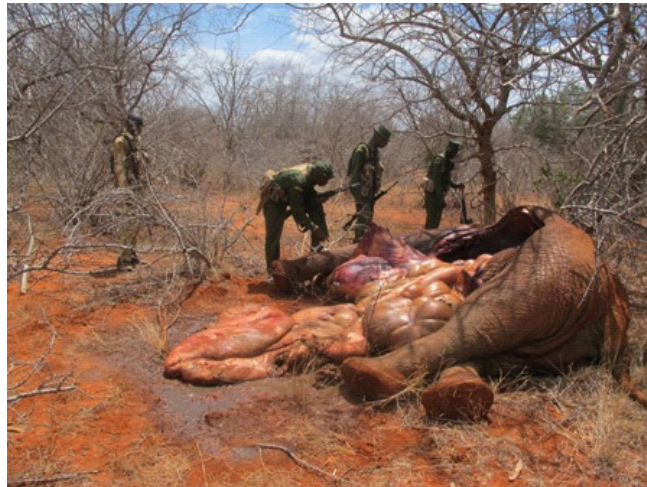
A fresh elephant carcass at Wamata area