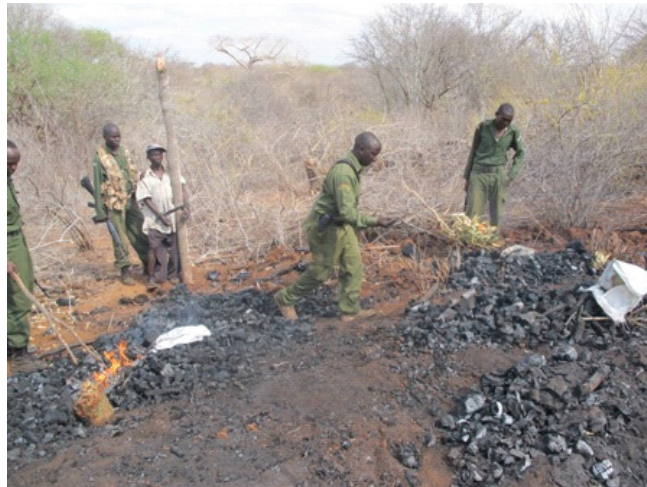
Illegal charcoal burning site