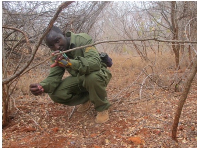
The team lifting snares