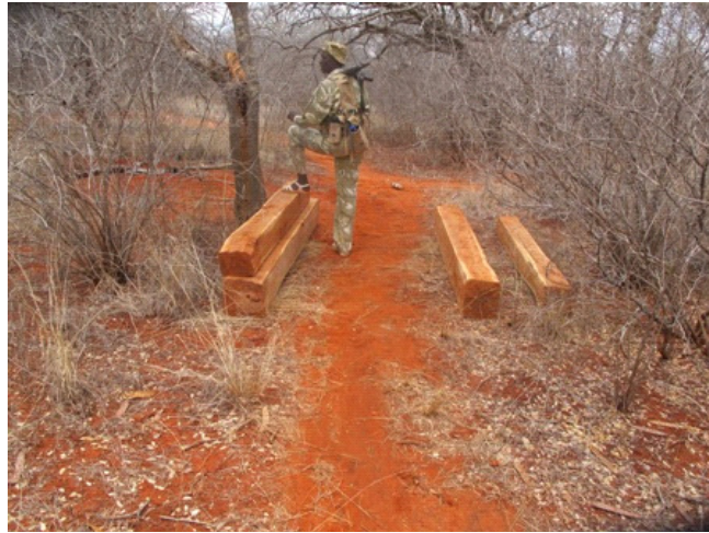
Illegally logged wood found in the Park