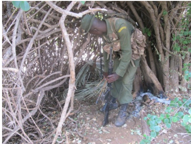
A recently used poachers' camp