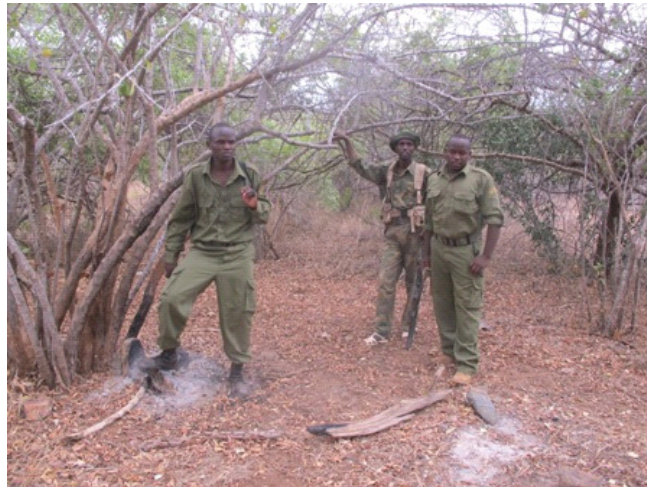
Poachers hideout at Tiva river area