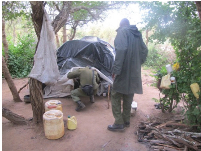
Illegal loggers hideout inside the reserve