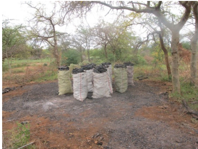
Large amounts of charcoal burning in the reserve