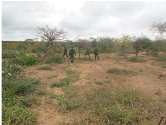
Team on joint patrol with Amboseli/Tsavo group security