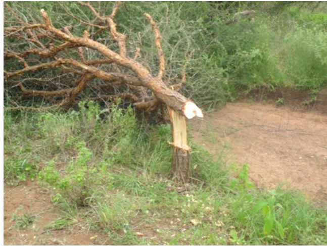
Logging at Kunju area