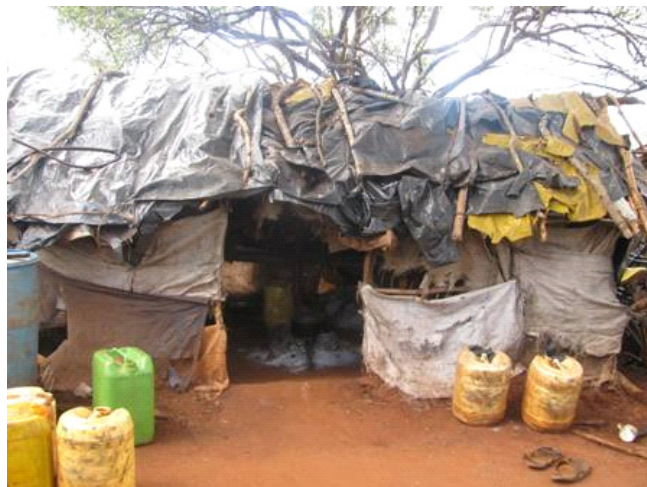
Charcoal burners hideouts