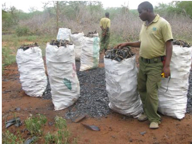
Mass charcoal burning at Mwasui ranch