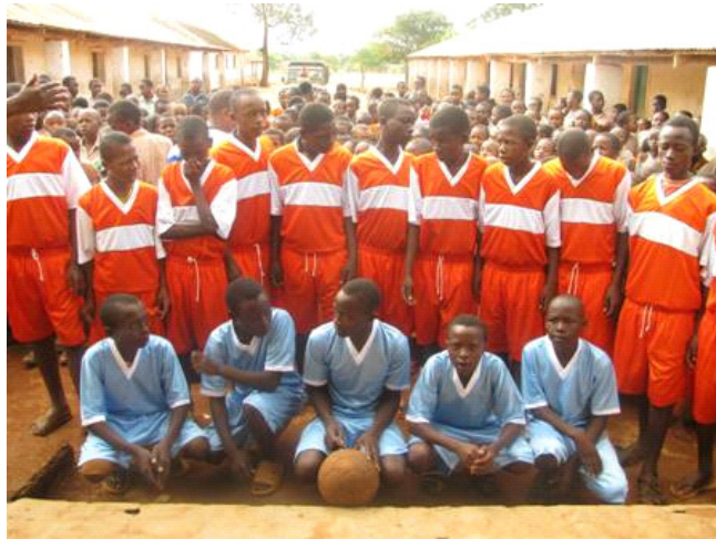
Football team uniform being donated to Maktau School