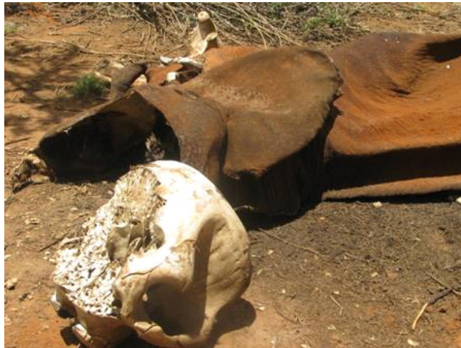
A poached elephant at Maktau area