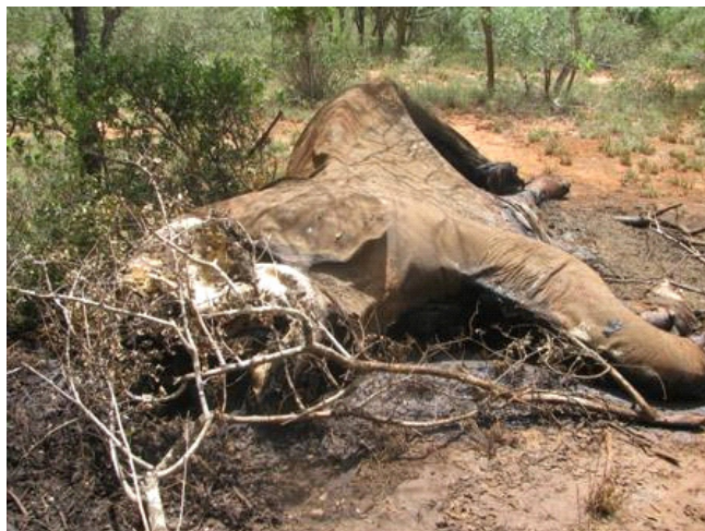
A poached elephant at Mwasui Ranch