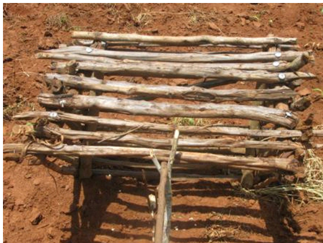
A birds trap at Taita Wildlife Sanctuary