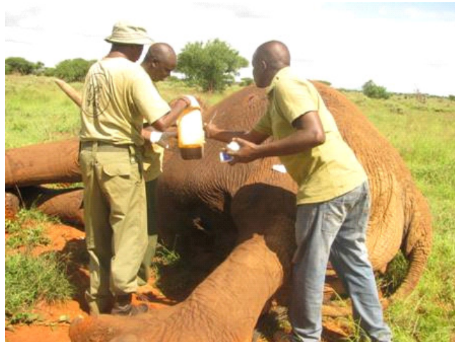
The Team assist the Vet with the treatment of the arrow wounded elephant