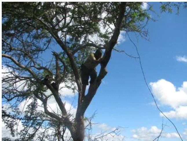
The Team removing giraffe snares from trees