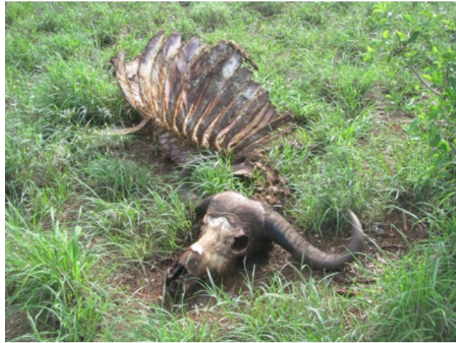
Buffalo carcass found on patrol, died of natural cause