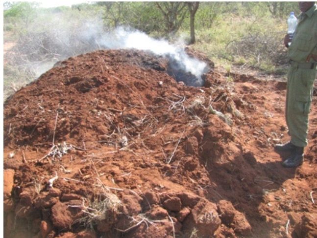
Charcoal kiln at Oza