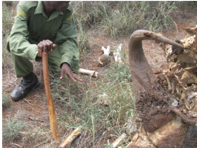
Snared buffalo carcass