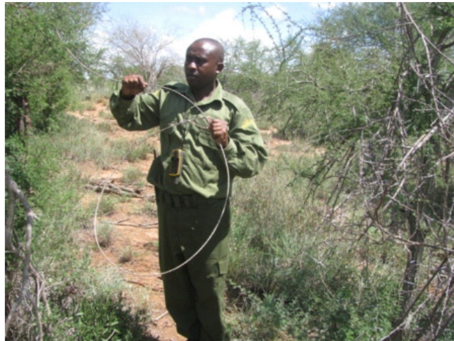
Lifting large snares