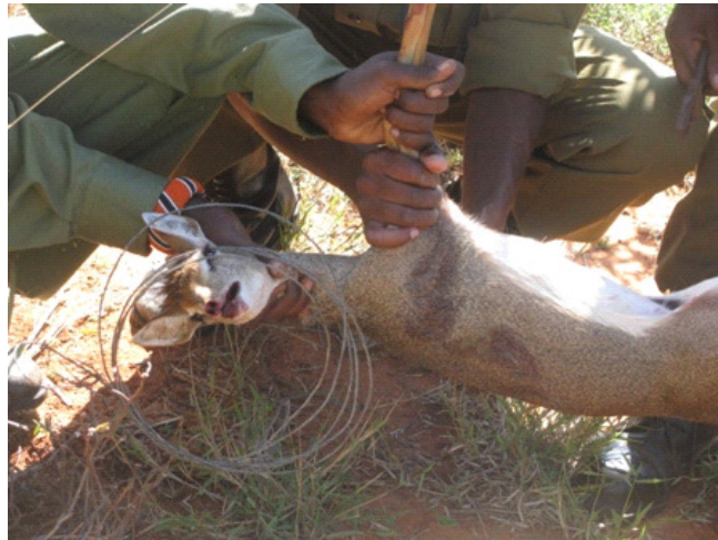
Rescue of a dikdik from a snare