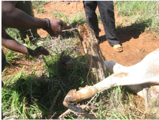
A snared domestic cow