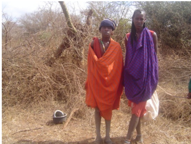
Above: Two men arrested for illegal livestock grazing in the Park