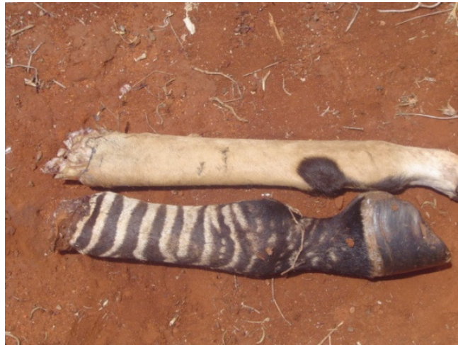
Above: Remains of butchered Zebra and Lesser Kudu