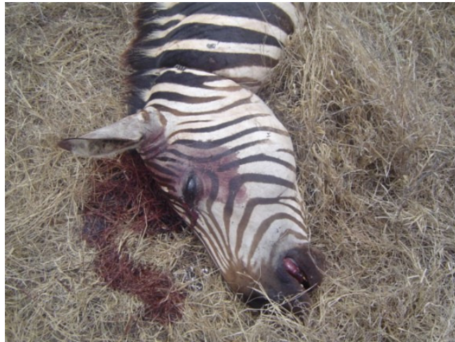
Above: One of 6 snared Zebra found near the Tanzania border in Tsavo West