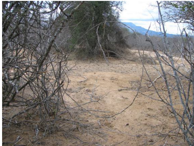
Above: Large snares at Oza Ranch