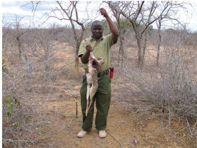
Above: A Snared Dikdik found at Oza Ranch