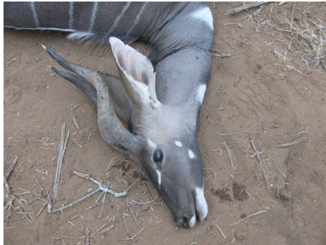
Above: A snared Lesser Kudu found at Oza Ranch