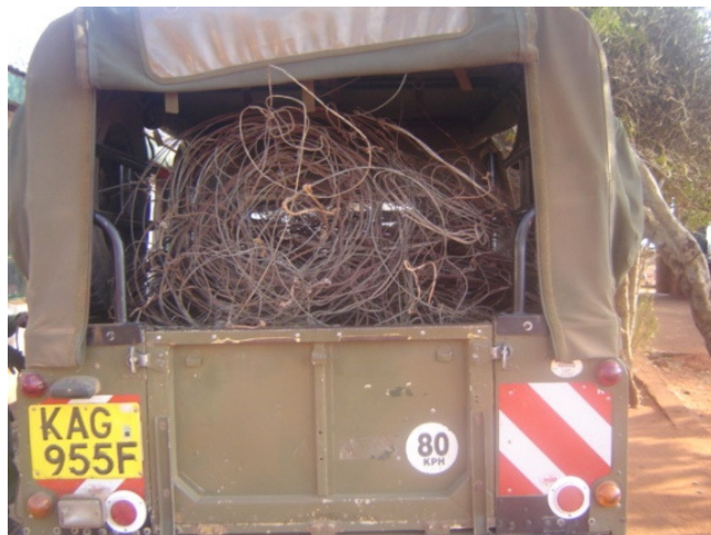
Above: Snares lifted in the last few months are moved to storage