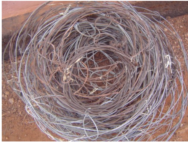
Above: Snares lifted in one days patrol near the Tanzanian border