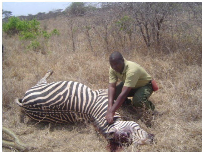
Above: A snared Zebra near the Tanzanian border