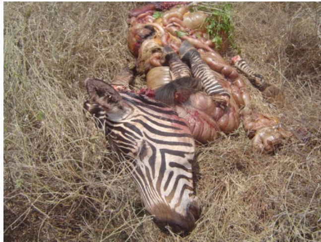
Above: Remains of a poached Zebra