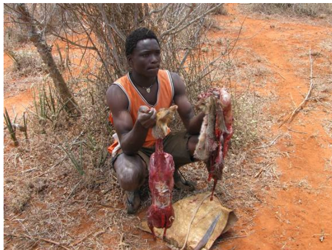
Above: The poacher arrested on Oza Ranch