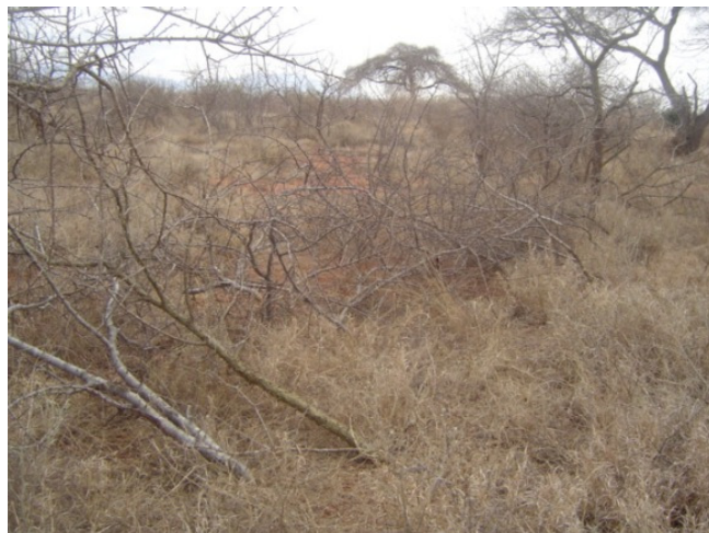
Above: Near the Tanzania border, a fence built by poachers to guide the animal to many snares nearby