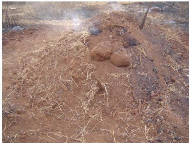
Above: Charcoal burning at Muhoho Ranch