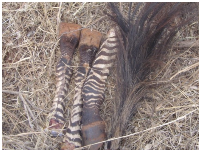
Above: remains of a poached Zebra