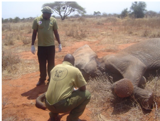
Above: The Team assist the Vet Unit with treating a sick elephant