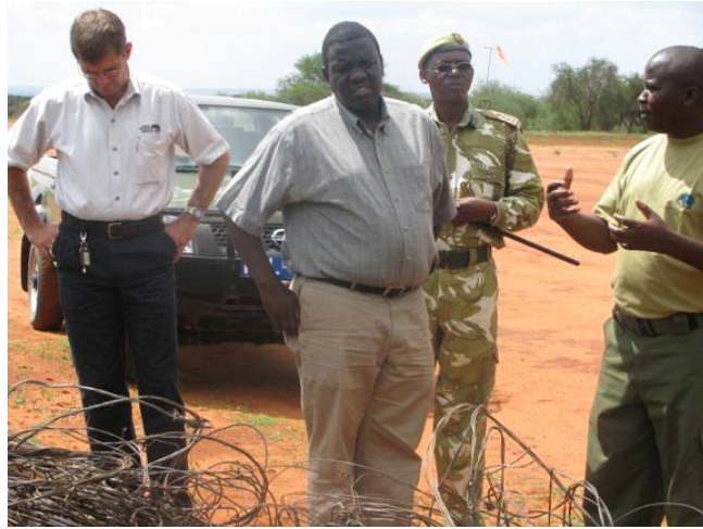
Director of KWS during his visit to the Ziwani Team Leader