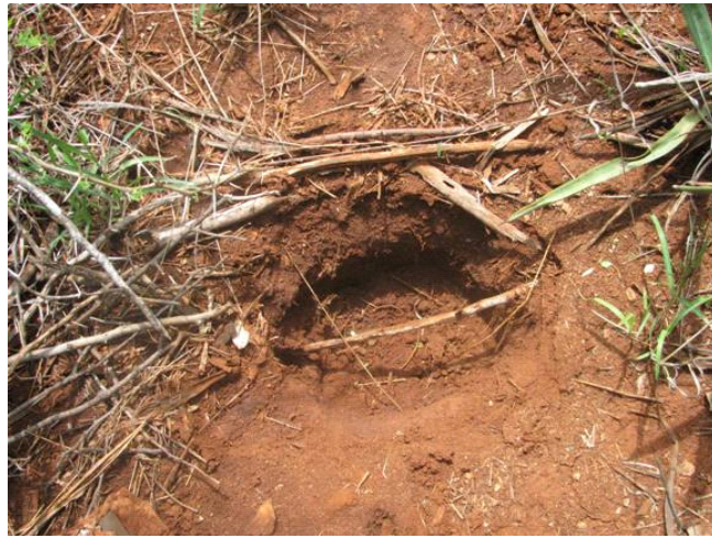
A pit snare at Mwatate Sisal Estate