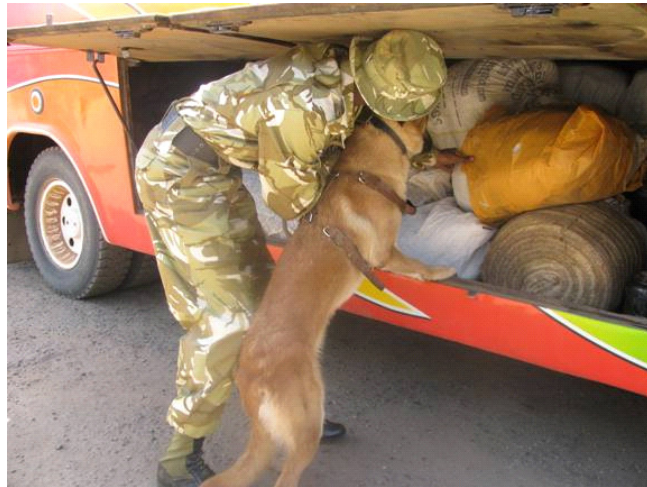
A joint operation with KWS who use dogs to search the Tanzanian border for illegal wildlife products