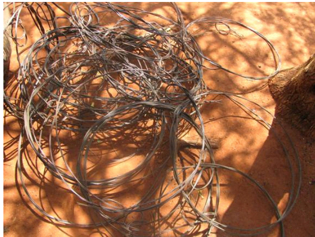
Snares lifted at Mbuyuni area inside park