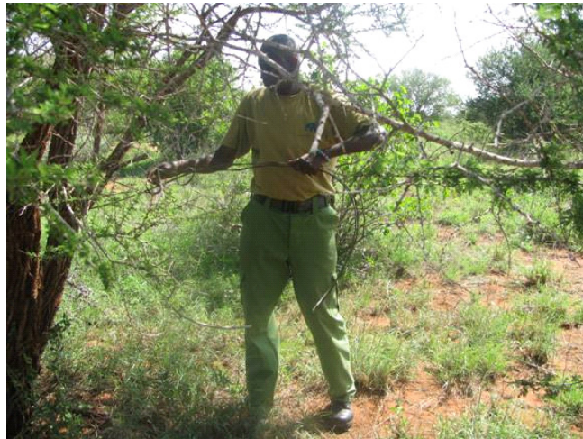
A team member lifting snares