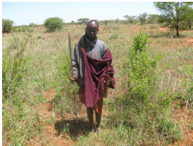
An arrested herdsman at Salaita area inside park