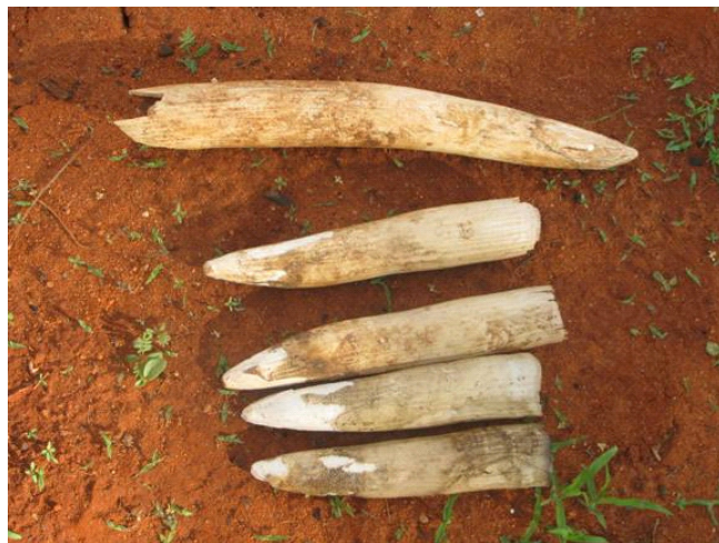
Tusks recovered at Taita Wildlife Sanctuary