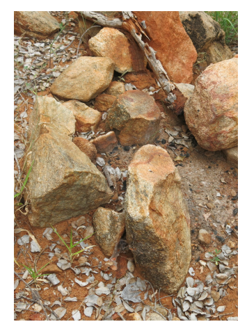
The Simba (Ziwani) team patrolled Kangechwa area, sighted an old poacher's hideout near a hill