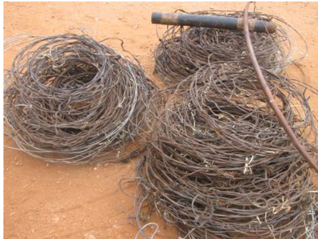
Over 200 snares recovered in a day of patrols