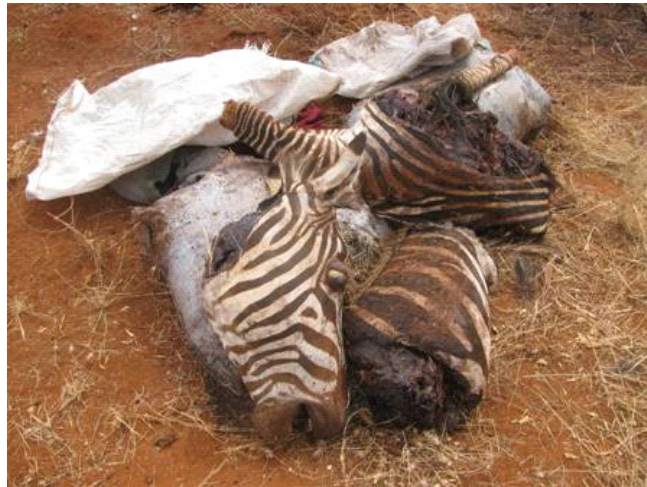
Remains of poached & butchered zebra at Toloa area