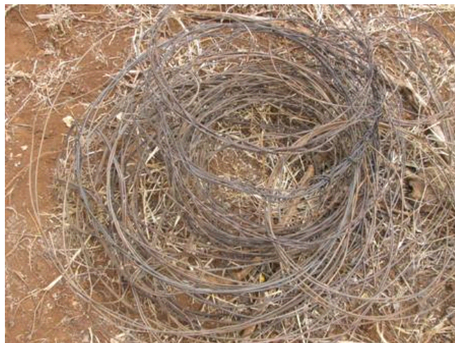
Some of the snares lifted