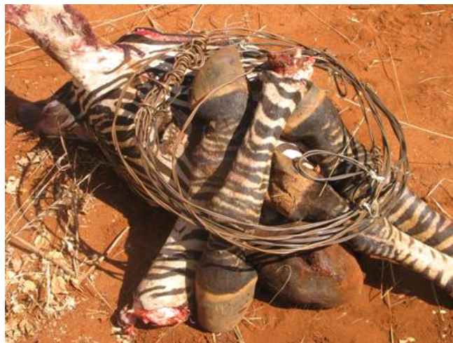
Remains of poached zebras at Toloa area