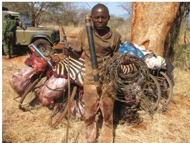
A Tanzanian poacher with the recovered bicycles and bush meat