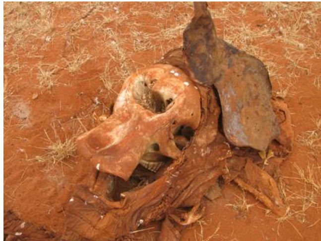
Remains of a poached elephant