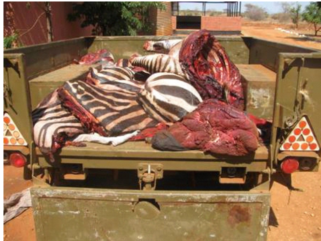
The bush meat recovered from the arrest