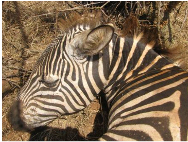
A recently snared Zebra