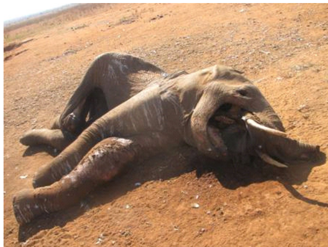
A poached elephant killed using poisoned arrows at Musoma area