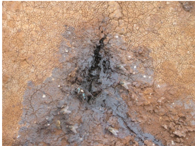
The poison arrow wound that killed the elephant