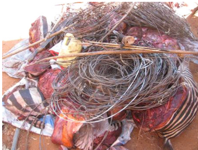
Recovered bush meat, snares, poison arrows and bows