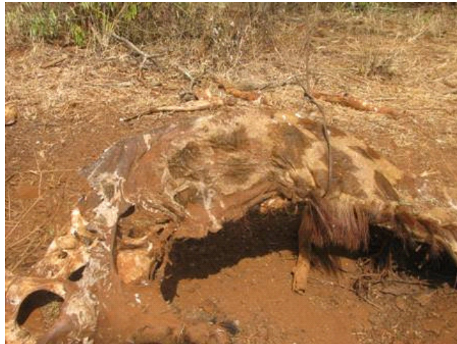
A snared giraffe