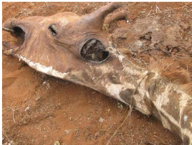
The snared giraffe