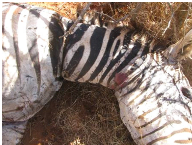
A snared zebra at Toloa area