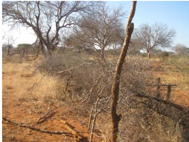
A 10 km snare fence line at Toloa