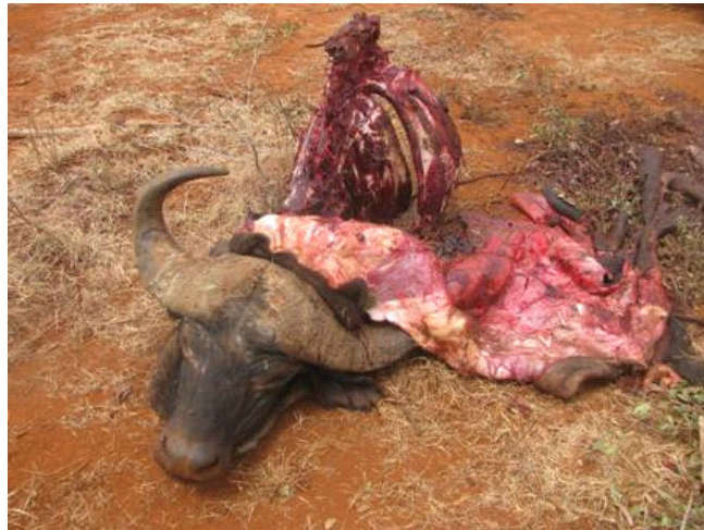
A poached buffalo at the Ziواني area