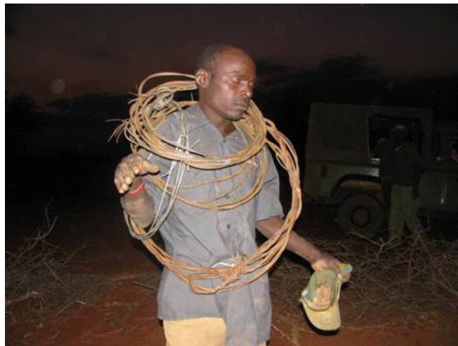
Arrested poacher at Mtakuja area