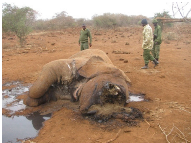
A poached elephant at Ziواني area