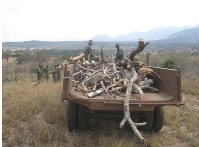
Heavy logging at Taita sanctuary