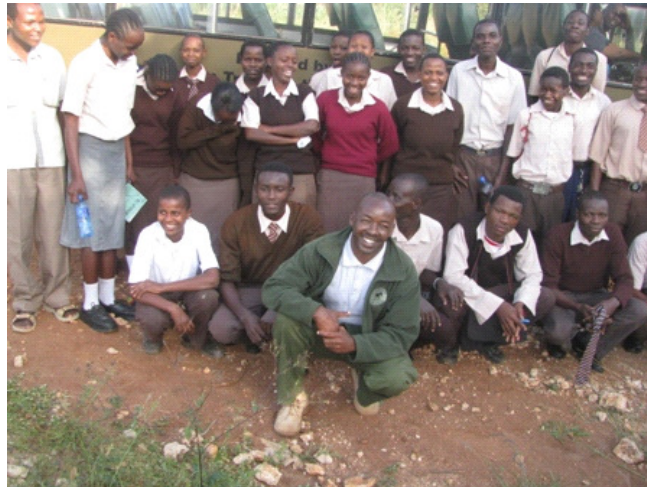
Kombolio students during their trip