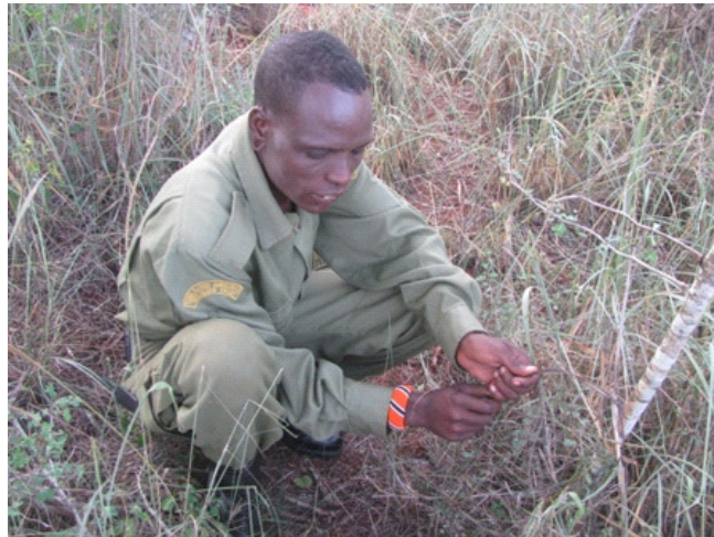
The Team lifting snares near maktau hill