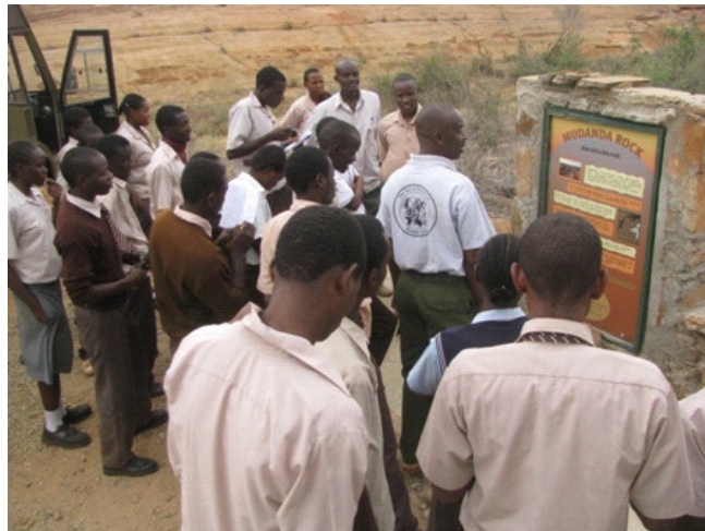
Kombolio students at mundanda rock