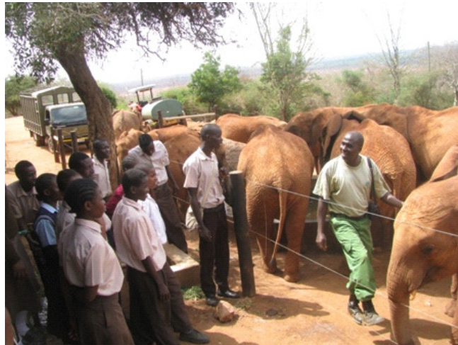
Kombolio students at the Voi stockade