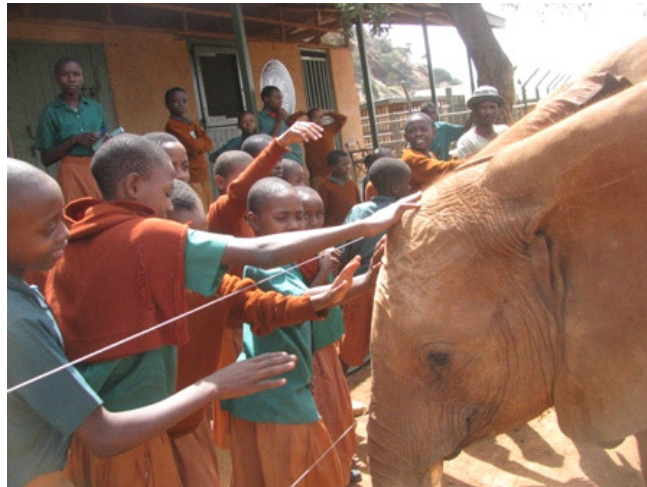
The students learn about the elephant orphans cared for by the DSWT