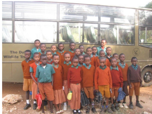
Mlugh Primary School during their trip to the Park