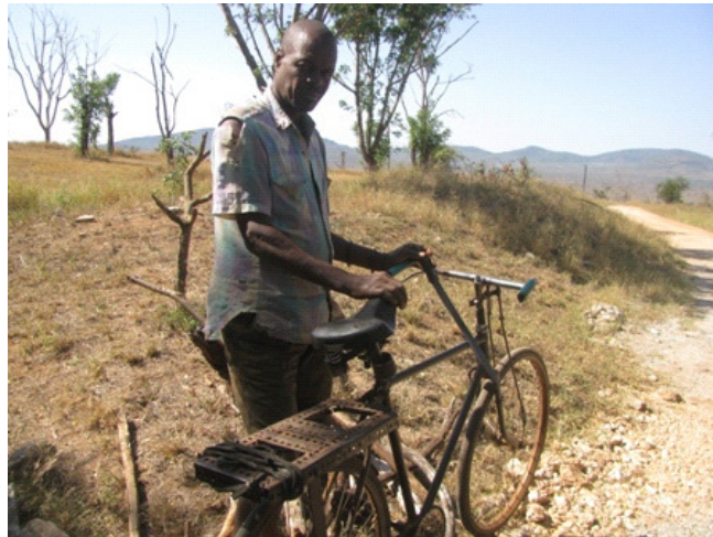
Charcoal burner arrested at Taita hills sanctuay