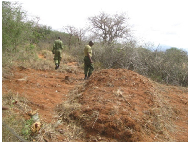
Charcoal burning at Maktau hill