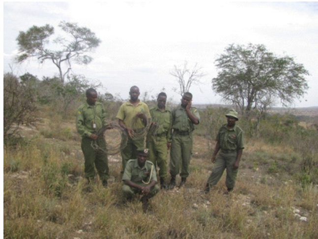
Some of the snares lifted during Patrols