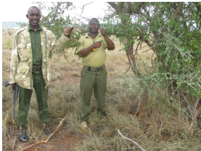
A team member lifting a snares