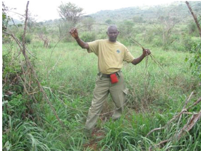
A team member lifting a snares