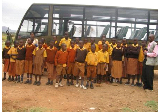
Maadakini primary school at Lake Jipe