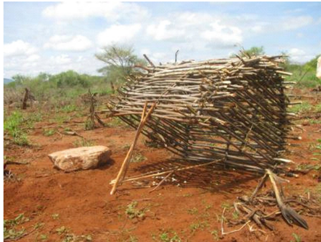
A bird trap at Taita wildlife sanctuary