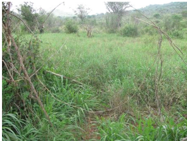
A large snare