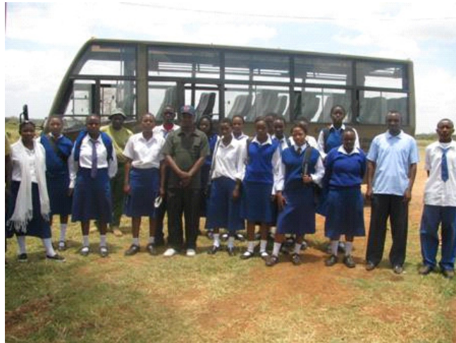
Alan mjomba students at Lake Jipe