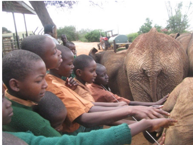
Pupils enjoy watching baby elephants at the Voi stockade