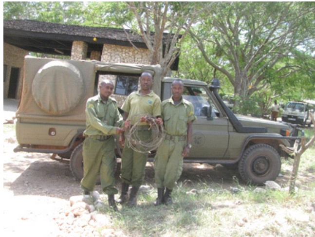
The team with some of the snares recovered in a day