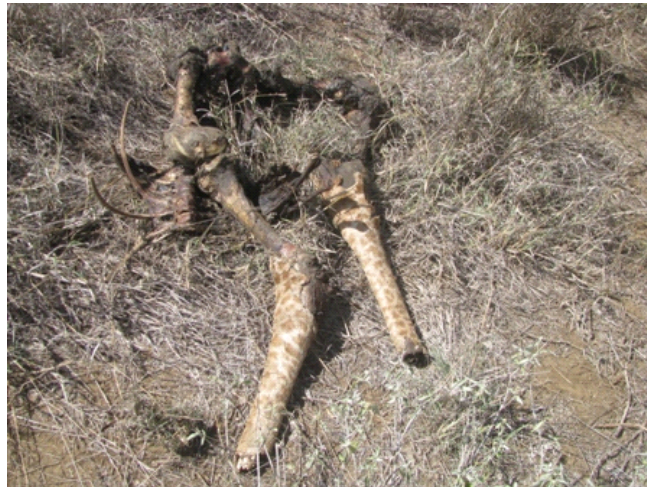
Remains of a young giraffe at Lualeny ranch