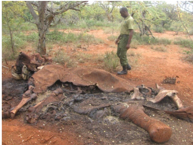
Elephant carcass along oza to kishushe park boundary