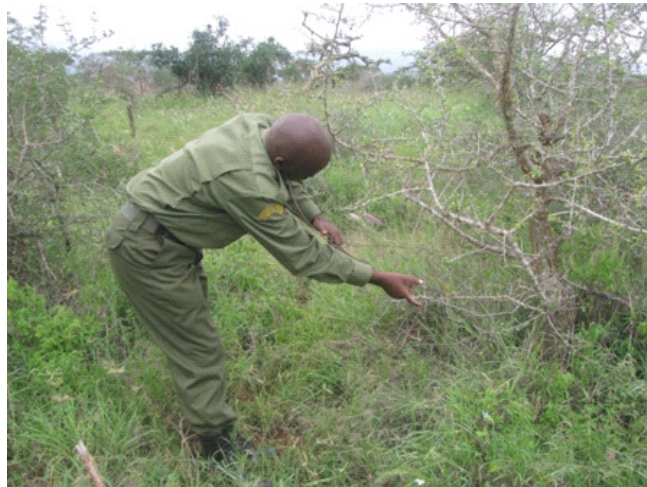
The team removing snares on Lumo