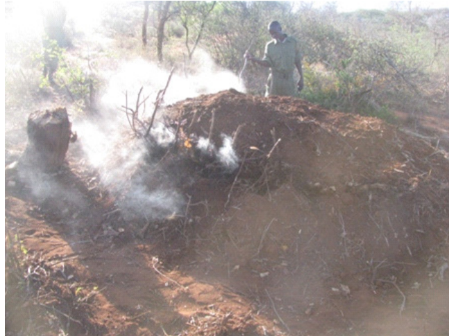
Illegal charcoal kilns on Ranch land