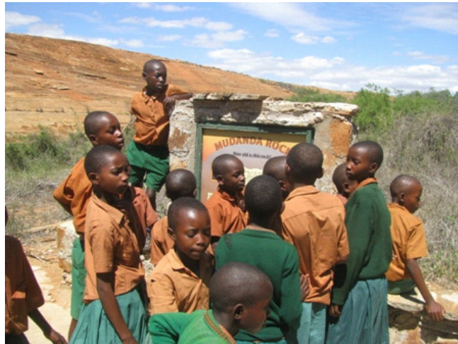
Students taken to Mudanda Rock during their trip