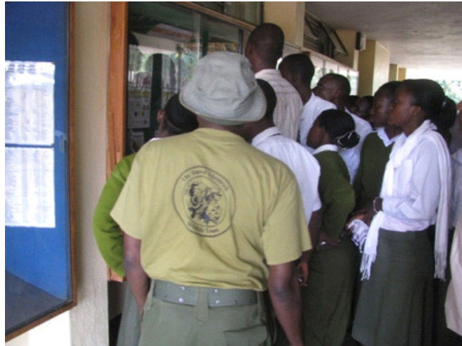
The students are taken to the education centre during their trip