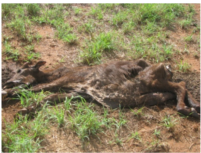
Above: The carcass of a buffalo found in Salt Lick Ranch