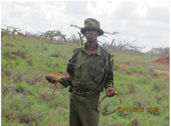
Above: A Team member showing large snares targeting buffalo