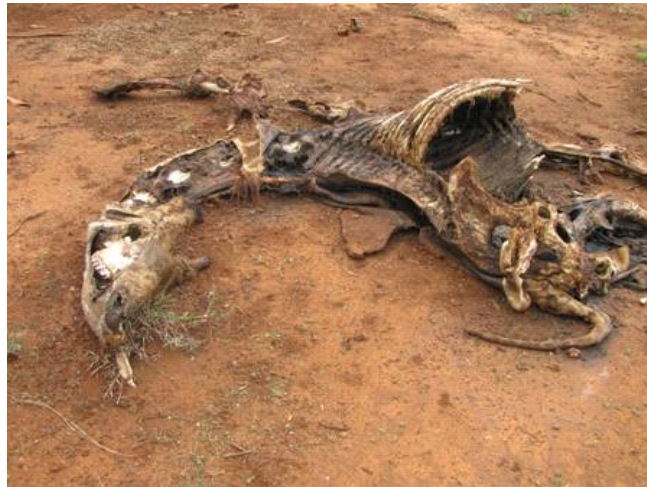
Some of the remains of a giraffe carcass at Lualenyi ranch