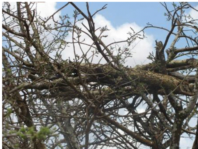
A shooting platform at Toloa area