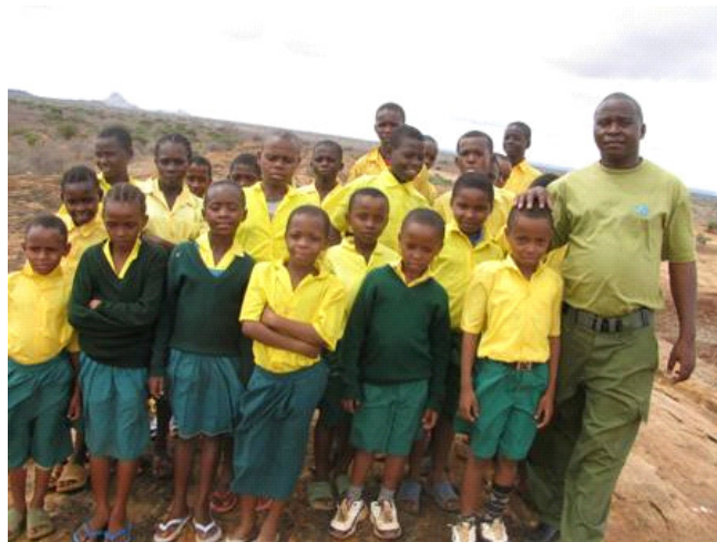
Pulpils at mudada rock in Tsavo East NP