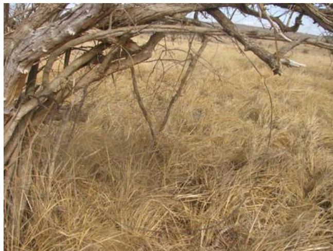
A large snare