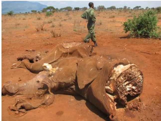
An elephant carcass at toloa area, the tusks missing.