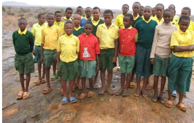
Mbulia primary at mudanda rock