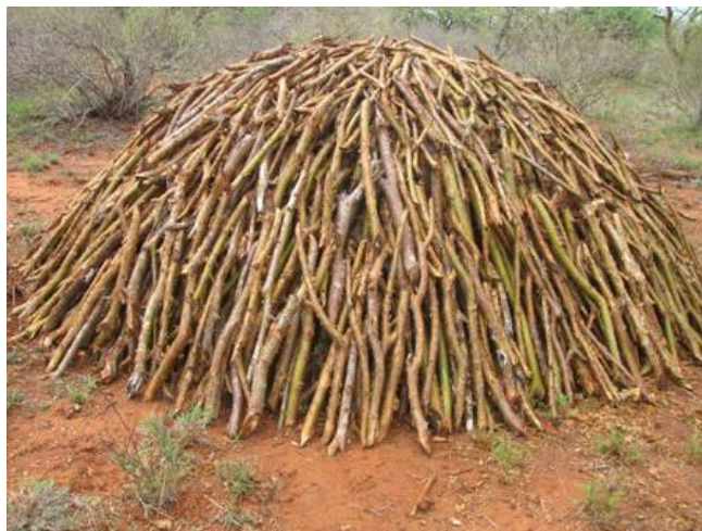
Charcoal burning at Mkuki ranch