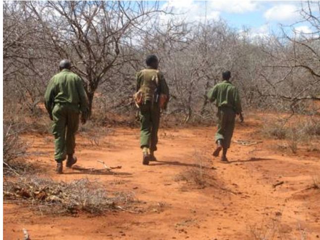
Team members during Patrols