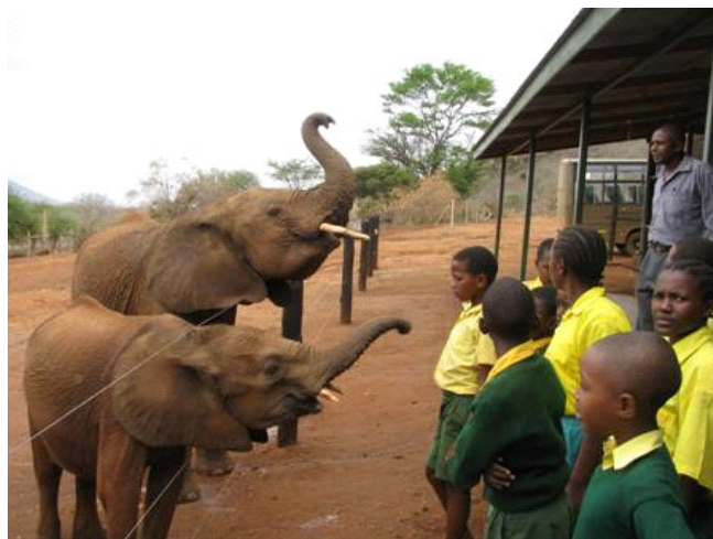
Mbulia primary at the Voi stokade