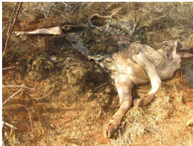
A snared domestic cow at latika area