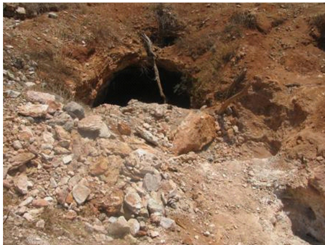
A mining hole at maktau inside park