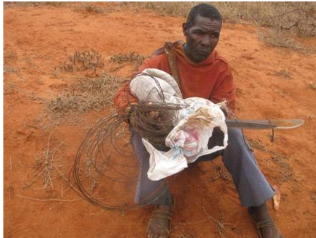
A poacher arrested while checking on his snares