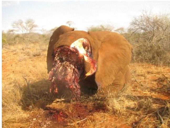
A poached elephant carcass