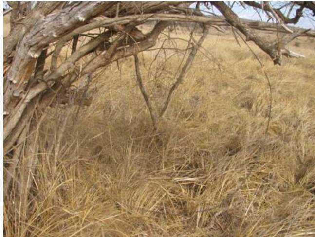
A large snare