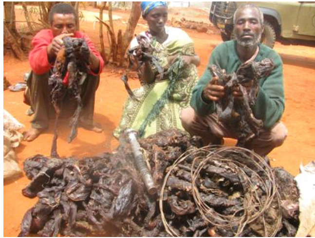
Three poachers display their catch after their arrest