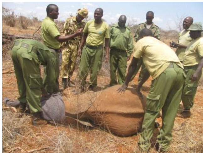
Rescuing a baby elephant at Mbuyuni area