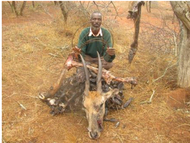
A poacher arrested in possession of eland meat