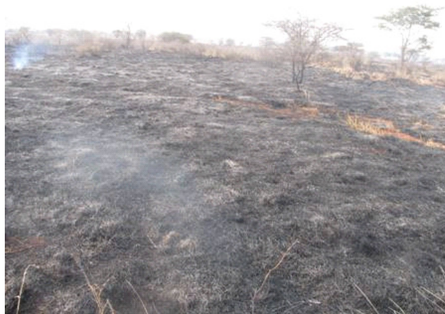
Bush fire at murka inside park