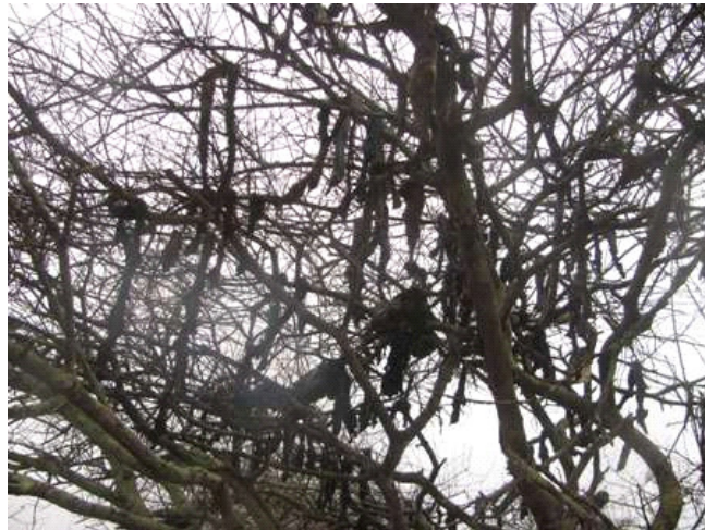
Bush meat being dried on top of a tree