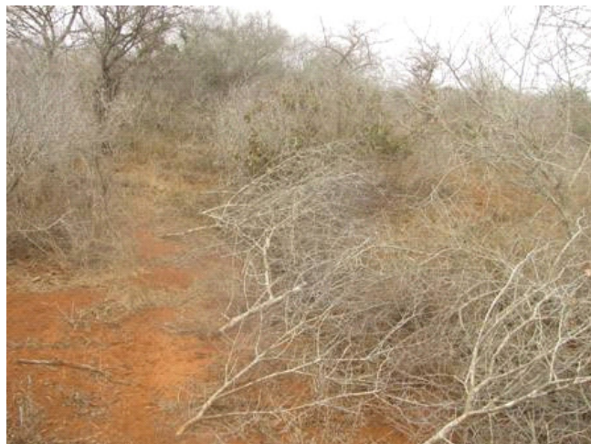
A snare line at maktau outside park