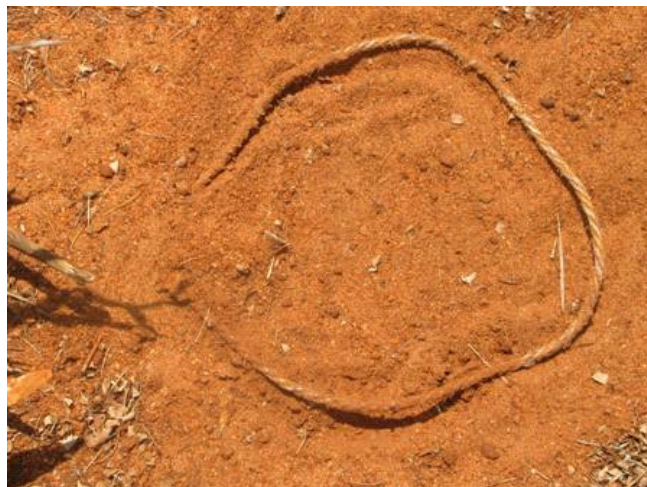
An underground snare at mwatate sisal estate