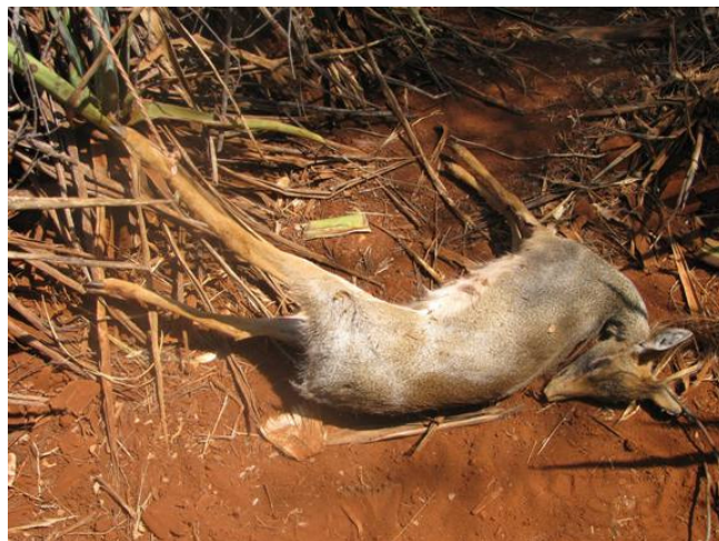
A Snared dikdik at Mwatate Sisal Estate