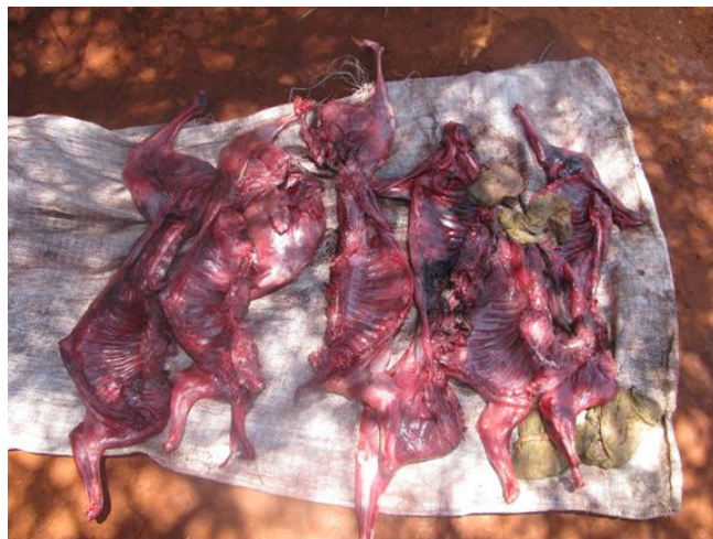
A display of the recovered dikdik meat at Maktau area