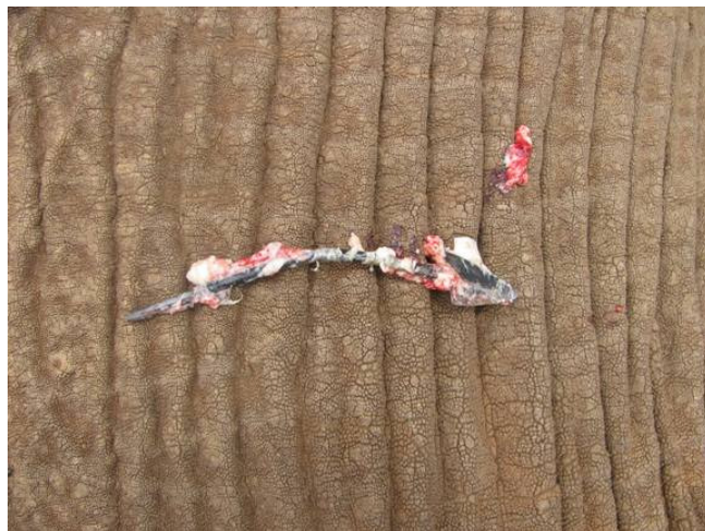
Arrow head removed from the elephant