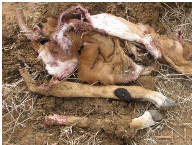
Remains of a poached impala found at Oza Ranch