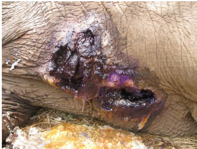
Arrow wound after treatment