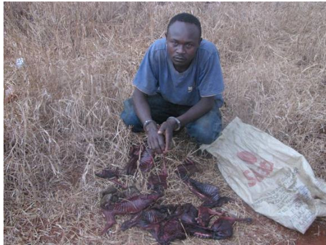
Arrested poacher in possession of 5 dikdik carcasses