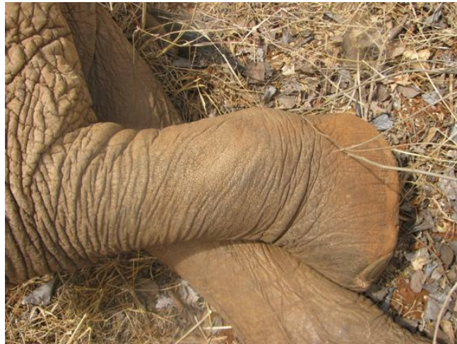
An elephant with a leg injury treated by the Veterinary Unit with assistance from the Team