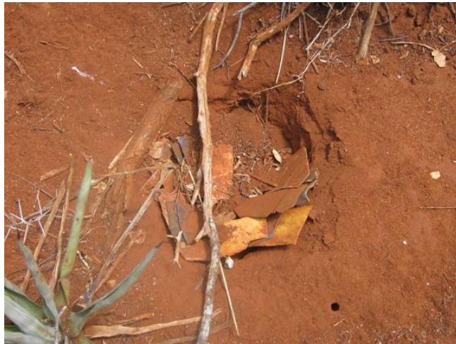
A pit snare at Mwatate Sisal Estate