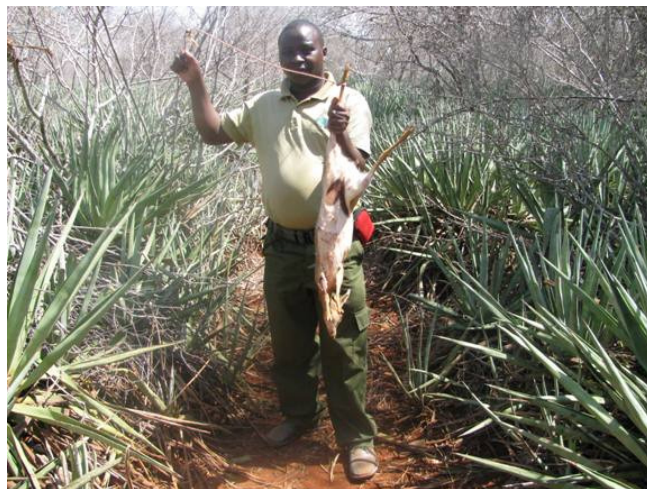
The snared Dikdik at Mwatate Sisal Estate