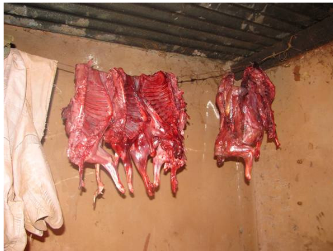
Bush meat found inside a poachers' home in Maktau