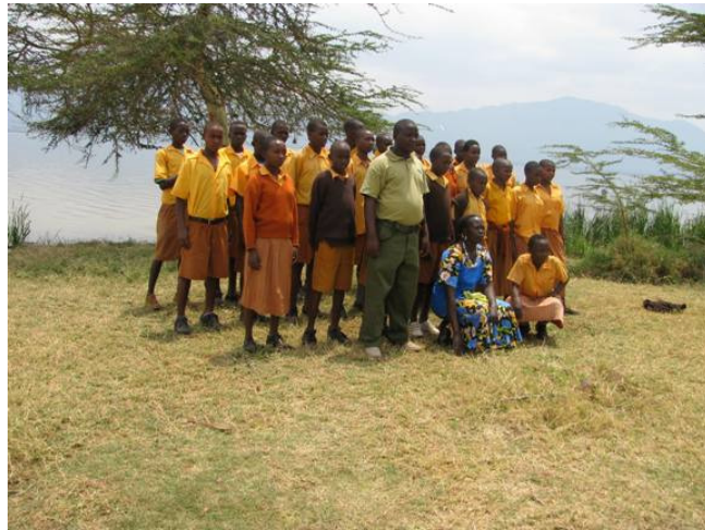
Mandakini primary pupils during thier school trip