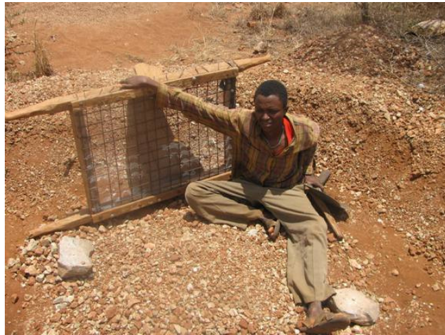
Arrested miner near Maktau