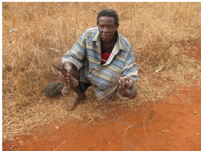
Arrested poacher at Oza Ranch