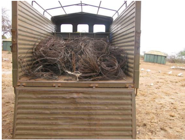
The Teams' snare collection over the last few months