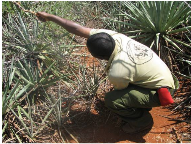
Lifting snares at Mwatate Sisal Estate