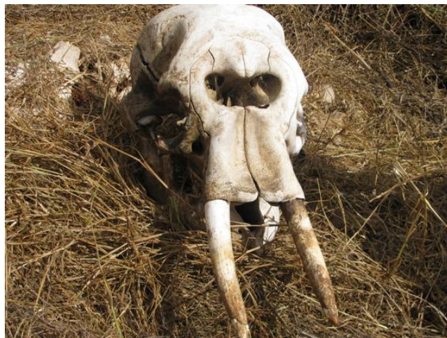
Tusks recovered during patrols in Taita Wildlife Sanctuary