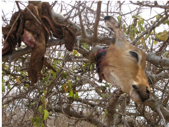
A poached Imapala found at Oza Ranch