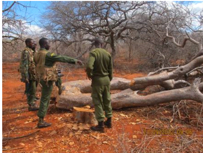
Logging at Mbulia ranch