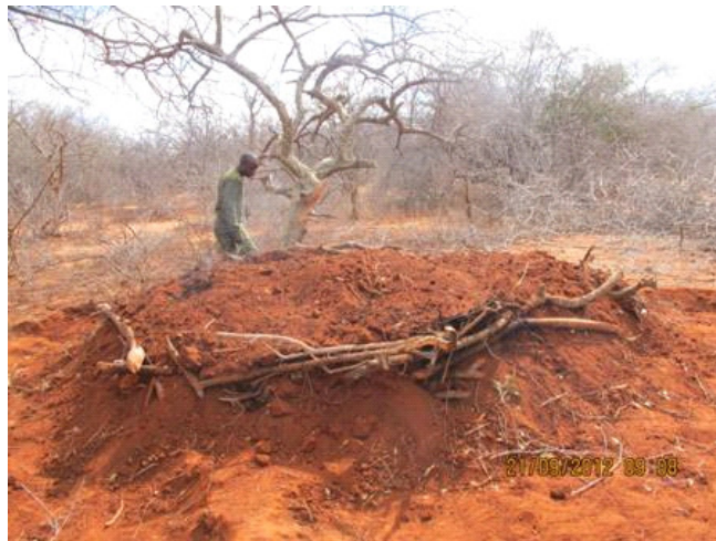
Illegal charcoal kilns