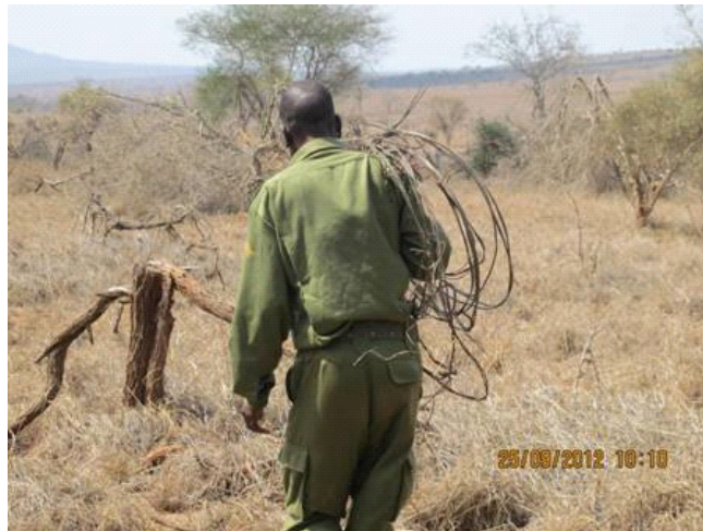
Lifting large cable snares during patrols