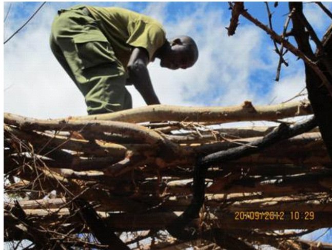
Destroying a shooting platform at Kishushe