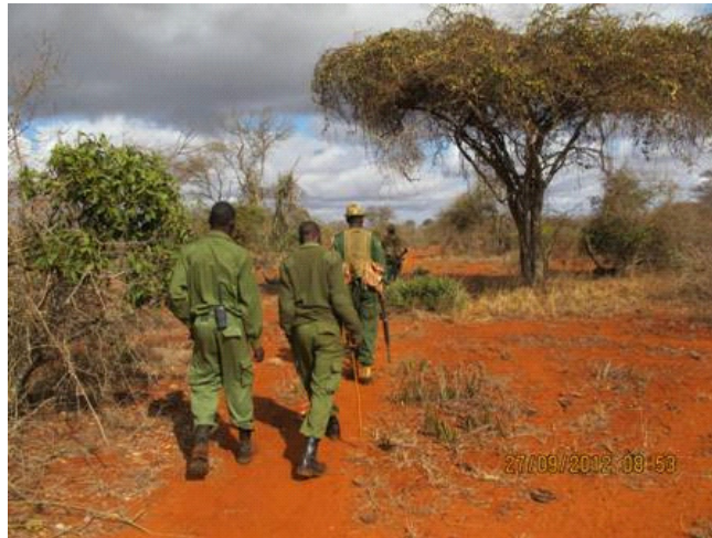
The Team on patrol at Oza ranch