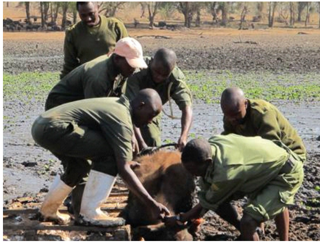
Team members in join the salt lick staff in rescueing a baby buffalo from the mud